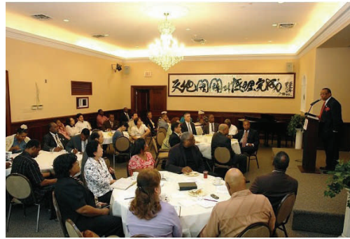
ACLC Prayer Breakfast Meeting in DC on Aug 28

• : Red Dots indicate locations where ACLC Prayer Breakfast meetings took place