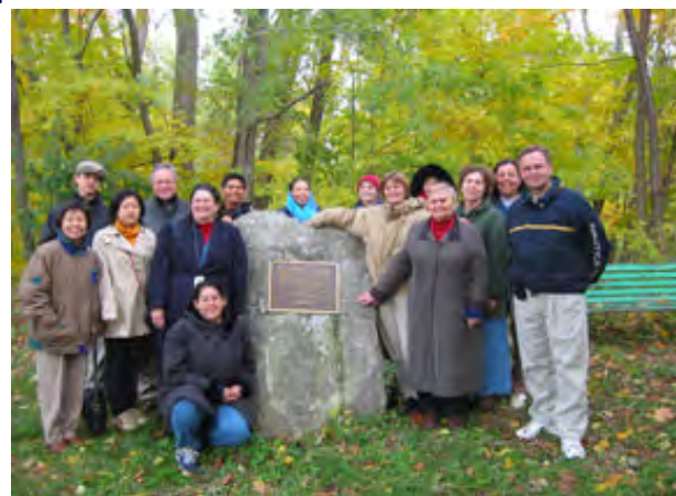
Some of the Conference Participants on Mother’s trail at UTS

There was a resource fair where the best educational materials developed by our members were displayed. In addition many educators brought promising practice resources that they are using effectively in their mission to share with the