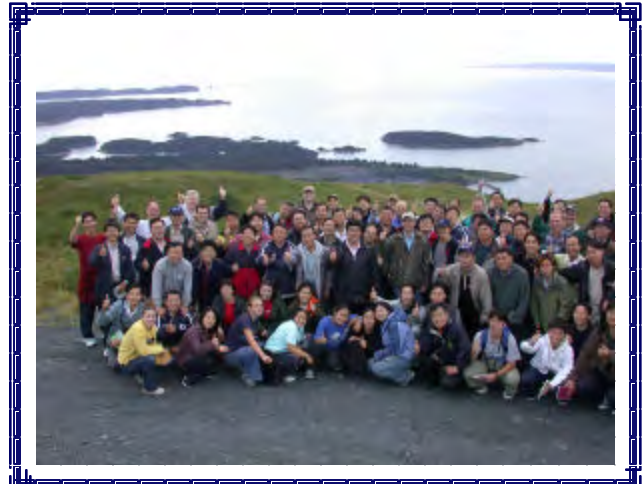
The World CARP Leaders Hiking in Kodiak

Most of the goals and objectives that we seek after are great things that have never really been accomplished before. They involve the greatest vision of all, making God's dream our own dream. Because this vision leads through uncharted territory, there is no specific right and wrong direction. When we use our past experience to ask the right ques-