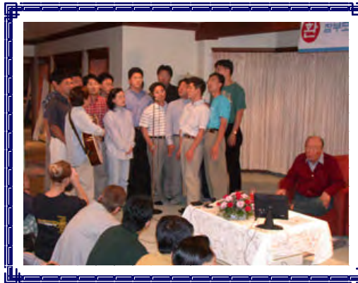
Midnight Singing During the Kodiak Workshop

To restore yourselves, you must clean away your sins with a degree of intensity equal to that sin. You must wash off the stains of sin. Sun Myung Moon