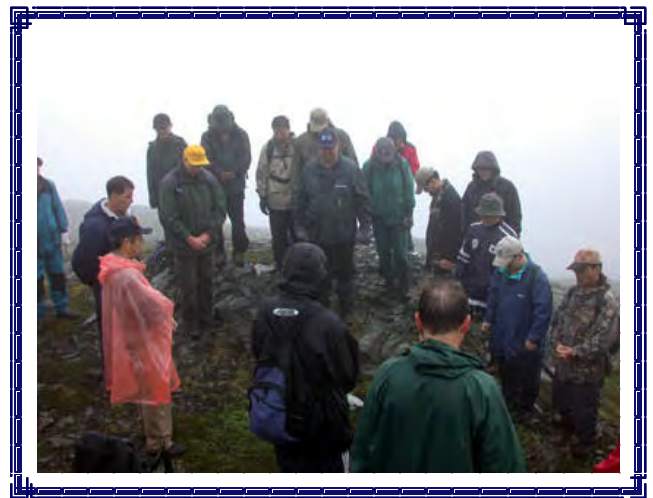
Some lessons can only be learned after the challenge is faced

Most of the leaders who have participated in these workshops