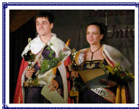
Top: Participants of MMU Hungary 2002