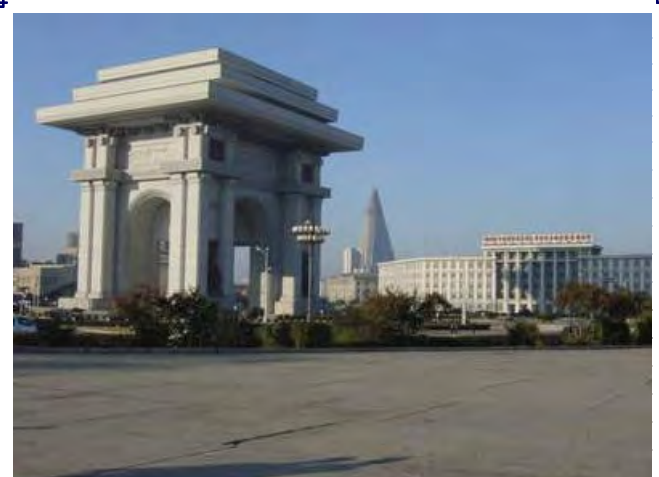
Top: Peace Motors Plant. Middle: At Rev. Moon's boyhood home Bottom: Pyongyang's version of Paris' Arc de Triomphe