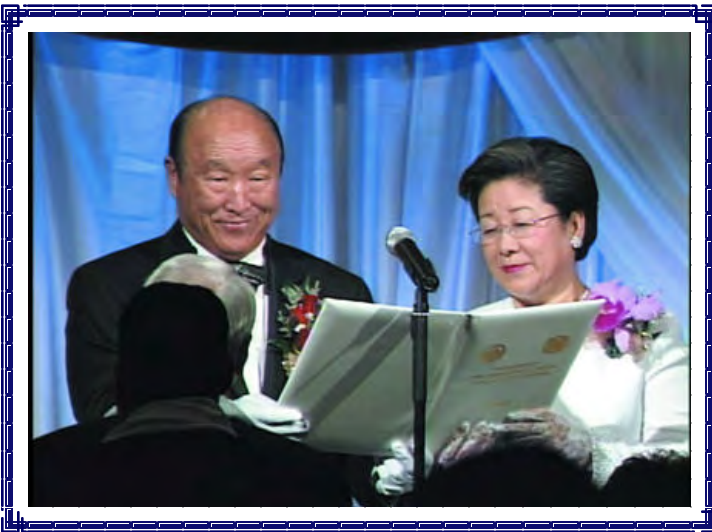
Screenshots: Archbishop George Stallings in Houston, True Parents Proclaiming the Blessing Vows in DC