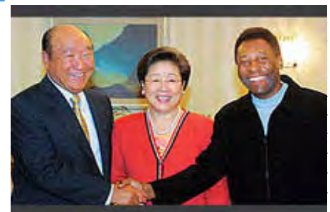
True Parents with Pele