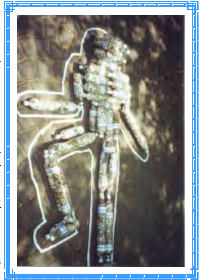
Delicate North Korean Embroidery