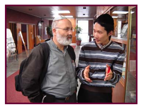
it, and with whom to do it with."

Bishop from the United Methodist Church, who felt "empowered" through the course to go back to his country, Zimbabwe, "with the knowledge of what to do, how to do