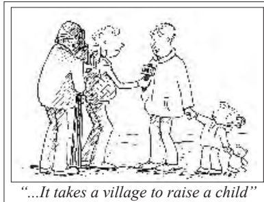
"...It takes a village to raise a child"