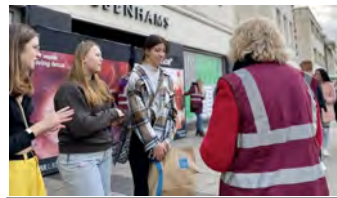
The Devon Team in Action

Exciting news this last month, two new teams launched on two opposite sides of the country. Our Scotland Central Belt team launched at the end of October, and our Devon team mid-November. With our biggest launch to date, our team of 24 educators took our Public Education Display to the busy shopping centre of Glasgow.