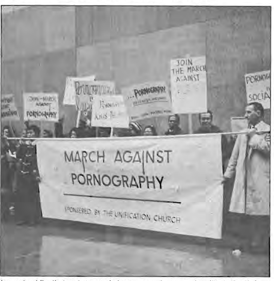
International Family Association regularly sponsors anti-pornography rallies in New York.

When the association was formed last summer, members immediately began giving out tickets for Madison Square Garden and hanging posters in areas that the regular team didn't cover, like some parts of New Jersey.