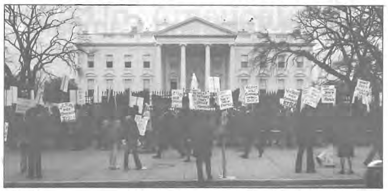
The President The White House Washington D.C.