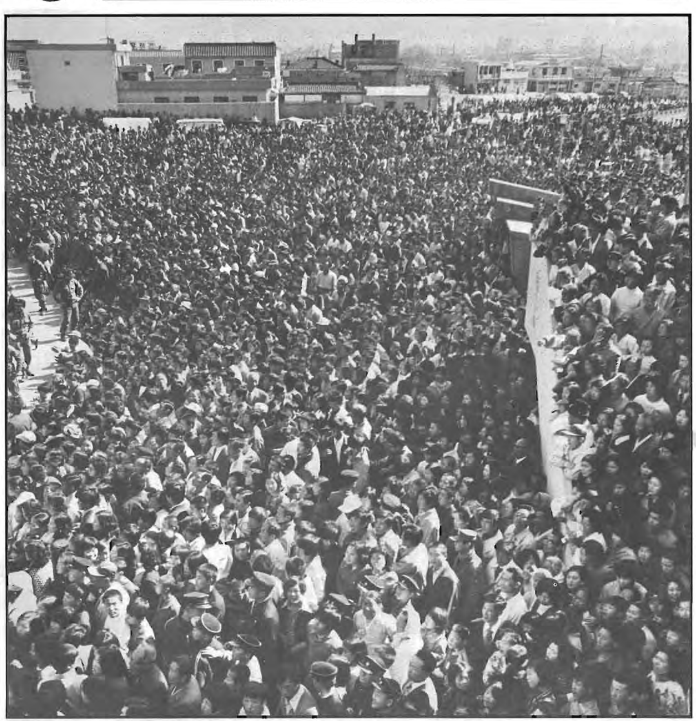
Thousands Throng Taegu Day of Hope Also Pusan and Seoul