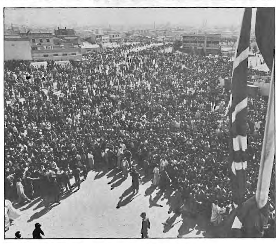
(Cover) Crowds outside hall at Taegu. This was but a portion; the crowd fanned out in the large area in front of the hall, as shown in this photo taken earlier (below left). (Above) Many waited like this for hours in Taegu. (Above left) The crowd at Pusan began gathering in the early afternoon.