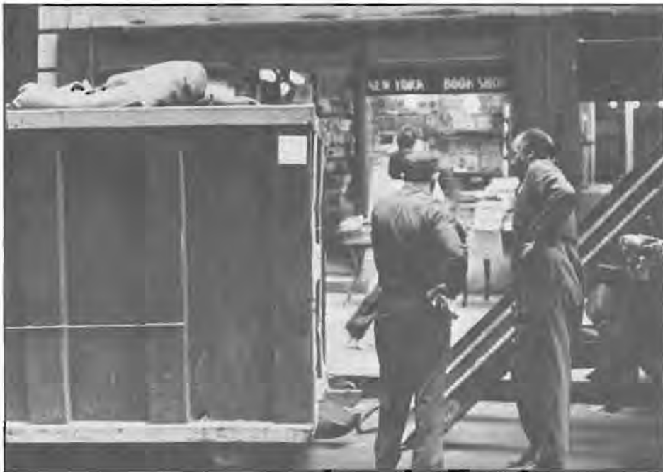
Workers debating how to best remove filled dumpster.