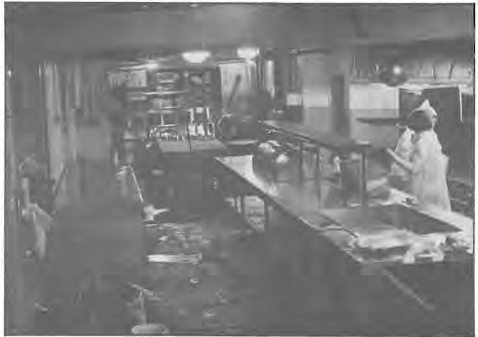
Many people worked on the cooking area of the large basement kitchen. (Right) Naval Jelly removes rust from the stove as work continues.