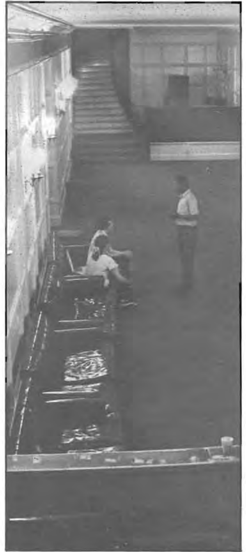
(Above) A foreign missionary walks through the front lobby as it is being restored and (right) New York members enjoy the same area several days later. (Below) Grinding down the old paint at the far end of the lobby. (Right) Mid-day traffic on 43rd St. Building is on right. Grand Central Station is at end of street. Chrysler Building is dimly visible above.