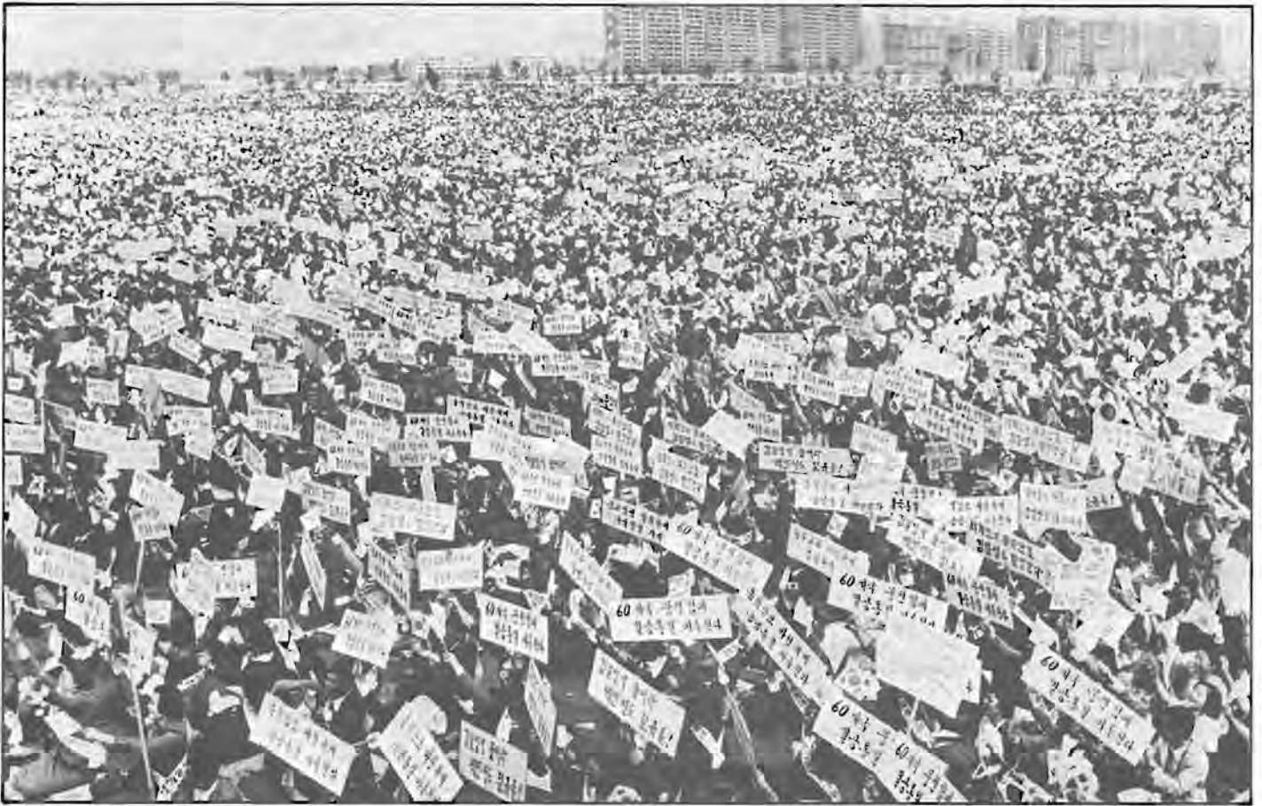
IOWC members located near the platform.

Strategy School about the strategy of Communism as follows: "Communism cannot coexist with capitalism. It is too early to attack (1931), our time will come in 20 or 30 years. We can gain victory only through surprise attack. Let the capitalist world eat well and sleep well by all means. The best way to do this is to initiate an absolute peace policy. Knowing nothing, they will enjoy peace and will respond to peace negotiations. In this way the capitalist countries will stupidly cooperate in digging a trap for themselves. We pretend to be their friends and gain time. And while they are relaxing we will deliver a decisive fist of iron. . . ."