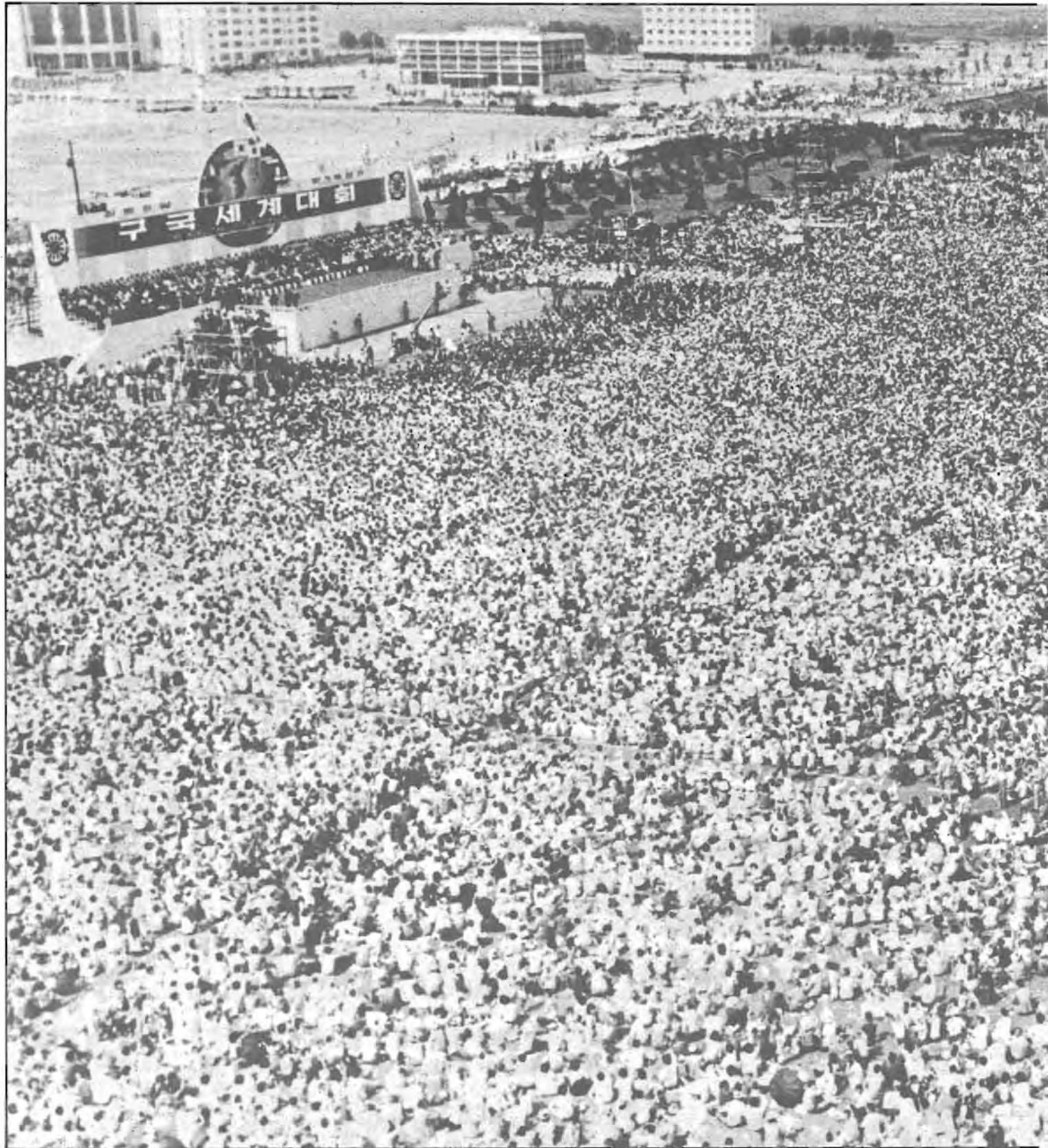
View of part of the crowd at Yoido Plaza on June 7th.