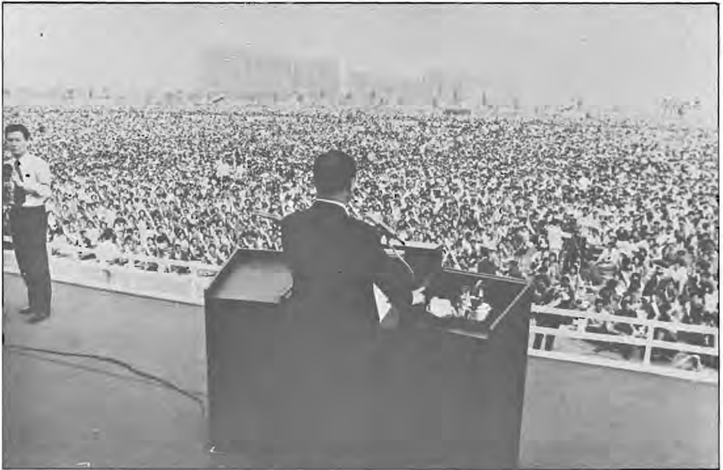
Father speaking to the crowd of over one million.

battlefield of these two worldwide ideologies which are against each other. The protection of Korean freedom is not only for the sake of Korea, but for the sake of the whole free world, and for the defense of eternal freedom, and for bringing to God a final victory. This is the reason why all freedom-loving people of the world should rise up in order to defend Korean freedom.