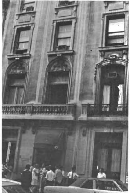
New York's new home – 18 East 71st Street

MARYLAND The College Park Family has moved to a farm in Upper Marlboro, Md. . . . The house, parts of which were built in 1780 and 1830, was originally called Mt. Ararat; it is set on a large tract of land that was originally part of a royal grant. The 18 room house has a 6 room basement suitable for an expanded candle factory and