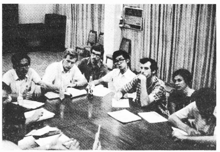
FLF'ers and other World Youth Crusade delegates meet with Chinese students in Taipei.

The delegation held a press conference in Taipei expressing their solidarity with the people of the Republic of China; it also sent an open telegram to President Nixon urging him not to abandon the free Chinese people. (The conference was held before President Nixon's telegram of 'reassurance' to Chiang