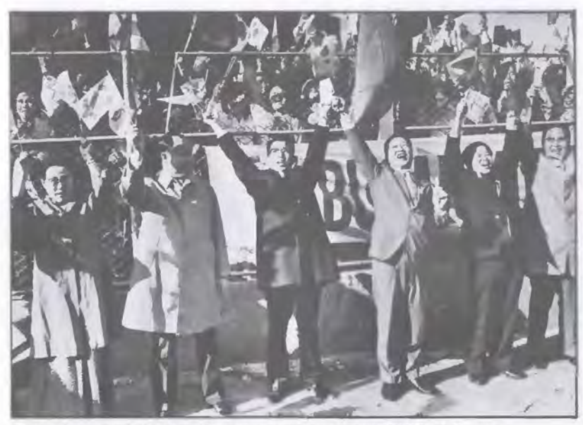
Rev. Moon and Korean Church members greet IOWC at Pusan.

in Pusan, we had to walk because our buses could not fit in the narrow streets leading up the mountain. Everyone stopped to watch as hundreds of foreign young peoplefiled past their doors.