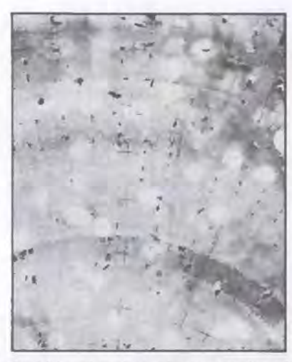
Bubble chamber shows tracks of each particle.

Man has traditionally held the belief that the universe is constructed like a building: Nature starts with raw materials and combines them in different ways to fashion each natural structure. Man has had different theories about this. Originally we thought there were four basic elements: fire, earth, air, and water. Then, we discovered that there were some 103 chemical elements which we thought were the basic elements. These basic elements are made up of atoms and eventually we found that even these atoms were made up of particles. Stars are seen as a collection of molecules, galaxies are made up of collections of stars, and the cosmos is made up of a whole collection of