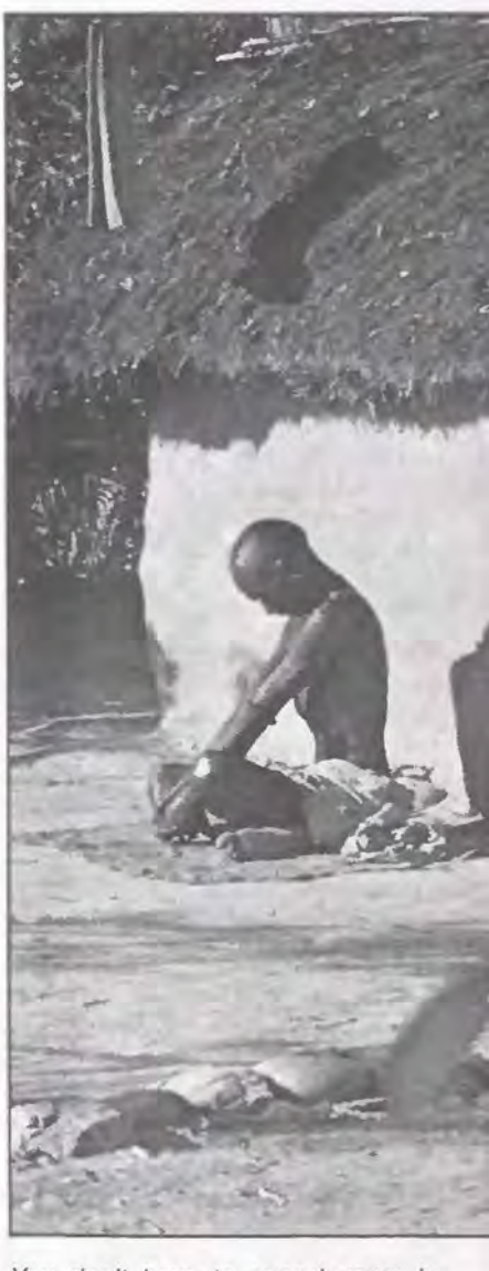
You don't have to spend years in meditation to have a mystical experience. Such episodes are almost commonplace today.