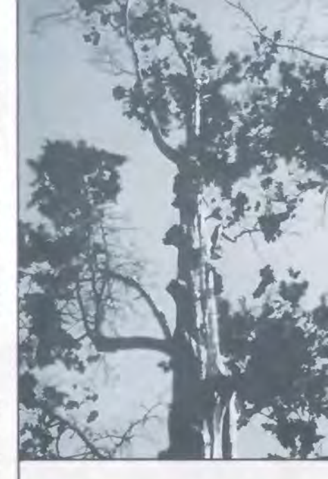
"His eternal power and deity has been clearly perceived in the things that have been made."

From the very beginning of the creation to today there has been such order and such complexity in the universe that you realize when you think about it that there just has to be as much order and pattern in our own lives today. Our day-to-day life has just as much order in it, just as much guidance from that Source as the universe displays, because we're part of the universe. God is acting on a very cosmic scale, providing direction for the universe, and he's also providing direction for our own lives. In everything that happens we can see a reason behind it if we look for it; even experiences that may seem very difficult at the time, when we look back at them after they are over we can see that there is often a lesson to be gained from the experience. We can realize that there is a guiding force directing our daily lives.