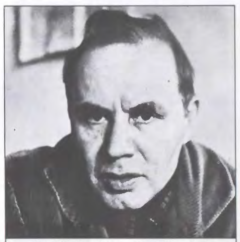
The Utopian dreams of a future which would never be realizable. I am speaking about devising a future which is possible, desirable, probable.

are able to criticize and analyze, but we have no therapists because good therapy is always temporary, modified according to its results, and because in politics we are afraid to admit errors. I am not underestimating the very serious