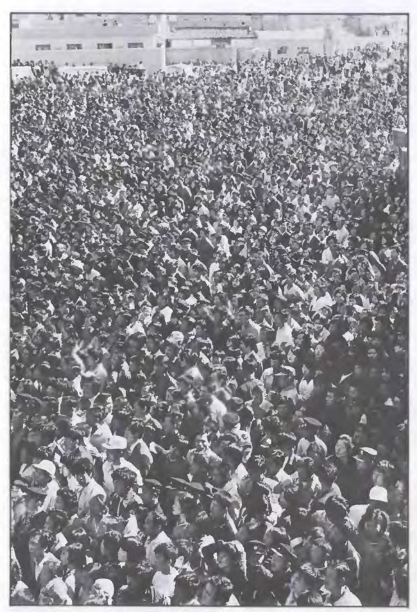
Waiting for the doors to open in Taegu.