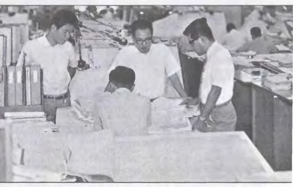
Japanese engineers draft blueprints for rotary-engine automobile. Sharing technology can bring mutual benefits.

relying mostly on imported technology provide further proof of the potential importance of foreign technology here. An example is Akzona, a fibers company which showed a 100 percent increase in sales from 1968 to 1973. This company, by coupling European and American technology, has been able to compete effectively in the U.S. specialty fibers market. Because it operates in the U.S., its success must be attributed to its use of European technology rather than to lower labor costs, advantageous tax laws, or more favorable government policies often associated with foreign business success.