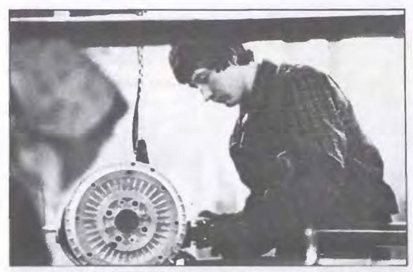
Russia's workers are not only decreasing in number but they are "unmotivated" and "inefficient," according to reports.

Khrushchev in 1961—"A highly organized society of free, socially conscious working people in which public self-government will be established, in which labor for the good of society will become the prime and vital requirement of everyone, a necessity recognized by one and all, the ability of each person will be employed to the greatest benefit of the people"?