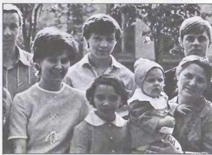
Most Russian citizens, like this family, are not aware of the freedoms they are

Industrial and technological progress in the Soviet Union is for many observers convincing proof of Russia's success and eventual triumph as a world superpower. But even a cursory study of Soviet society reveals these "progressive measures"—Five-Year plans and the like—as dogmatic tools to accomplish Marx's goals at the expense of the dialectic. To this end the Soviets seem blind that they have spoiled Marxism's virginity. They have paradoxically placed