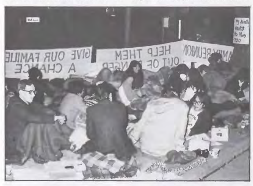
Australian members join the protest fast of Vietnamese students seeking help in rescuing their families just before the communist takeover.

The reason the students were fasting was to try and bring about a last-minute effort to bring their families to Australia before the communists came. They filed a case several weeks ago with the Australian government, but absolutely no action was taken. This raises a serious question concerning Australia, just how far left is