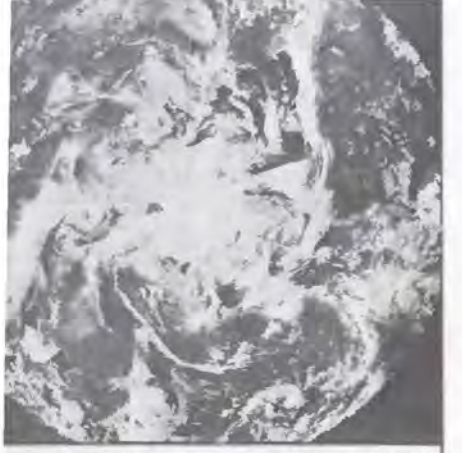
The Earth is a gigantic system which seems to "exhibit the behavior of a single organism-even a living creature."

chance and accident throughout geological history, but the creation of a Source with a very clear plan is mind.