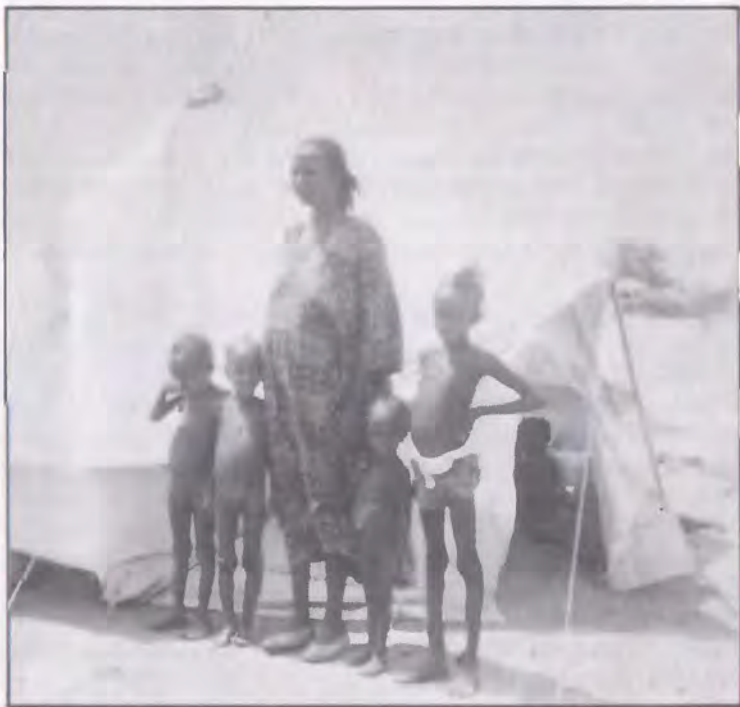
Poverty means hunger and primitive shelters whether on a Central American beach or the African desert.

happen. A guy who was always very nice and would come over from time to time came over and said that he needed $5 for dinner, because the Army was serving a kind of food that he can't eat because he has had stomach problems. He swore over his mother's grave that he would be back in three days to pay it back. That was the last we saw of him until about four weeks later when he came panting up to the door asking us for $20 for an emergency, a matter of life and death, etc. We just asked him why he didn't come back before now? He pleaded and begged,