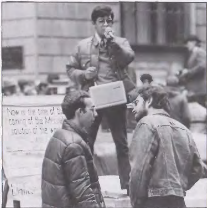
The Unification Church pioneer offers new hope—the Divine Principle.

their program, so our pioneer was asked to write one. The chairman was really impressed and very grateful. Another pioneer, in another city, was invited to speak at The Creative Center, a community service group. She talked in depth about America, the threat of Communism, and Rev. Moon. The director of the center wants her to teach the board of directors next, and to give lectures every week at the center.