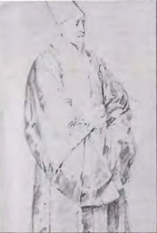
A drawing of a Jesuit missionary in Chinese dress, by Rubens.

as a religion. England, Russia, Austria, France and even Spain outlawed the Society of Jesus at one time or another on the pretext of its alleged subversive political activities.