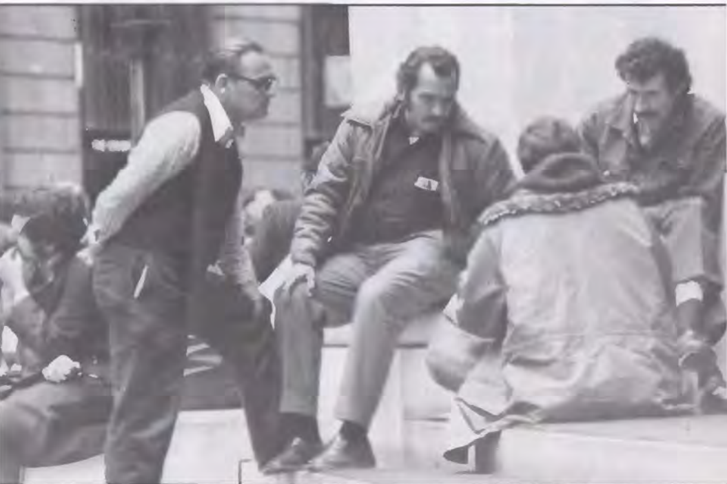
People of all backgrounds and ages are interested in finding God and finding solutions to the problems of this country.

"The woman said that then she felt the spirit of God completely overtake her; she was shaking and couldn't believe that it had happened. She was really excited.