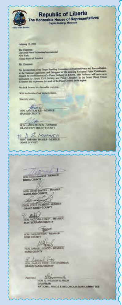
Members of the Liberian Congress requested that a Peace Embassy be opened to further the work of peace in the region.

regional issues. In her inaugural address, the president said, "My dear brothers and sisters of West Africa: You have died for us; you have given refuge to thousands of our citizens; you have denied yourselves by utilizing your scarce resources to assist us; you have agonized for us, and you have prayed for us. We thank you, and may God bless you.... To our sister Republics west, east and north of our borders, we make this pledge: under my Administration, no inch of Liberian soil will be used to conspire to perpetrate aggression against your countries."