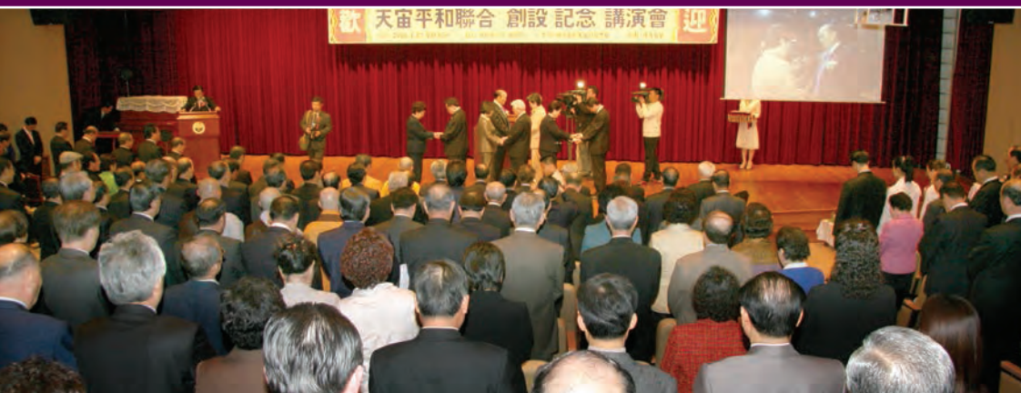
From March 25–April 3, on 9 occasions dubbed Rallies for the Restoration of the Homeland, Father will deliver a public speech, after which True Parents will conduct a blessing for the audience. The third event was held on March 27 in the main hall of the National Library in the National Assembly complex. Top : True Parents lead the audience through their vows Lower left : The National Assembly Building Right : True Parents' prayer with select couples