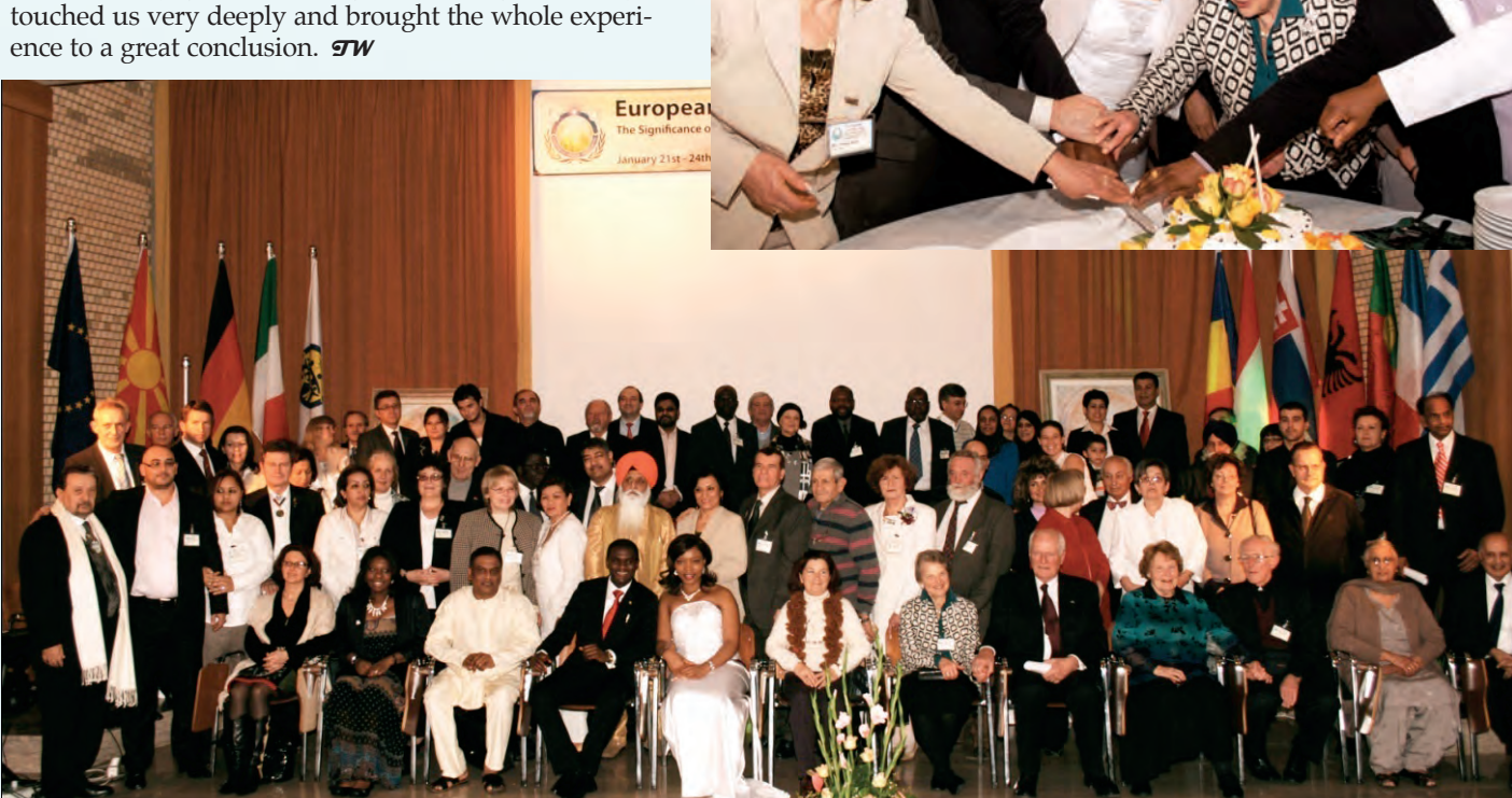
Participants of the European Leadership Conference and World Peace Blessing (January 21–24, 2010, in San Marino)