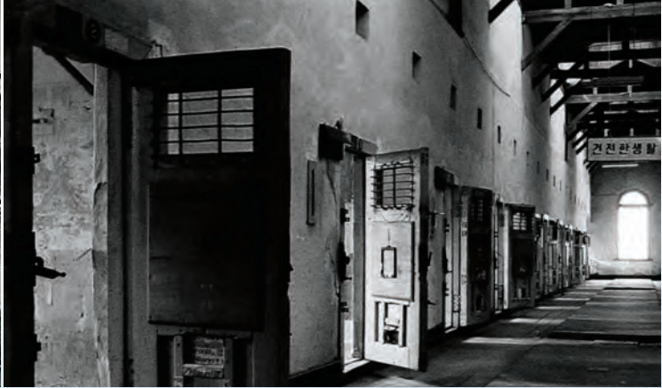
Built in 1908 by the Japanese in anticipation of an influx of prisoners once Korea was annexed in 1910, Seodaemun Prison held Father for three months in 1955. Left: The front entrance; Right: A cell block as it looks today.