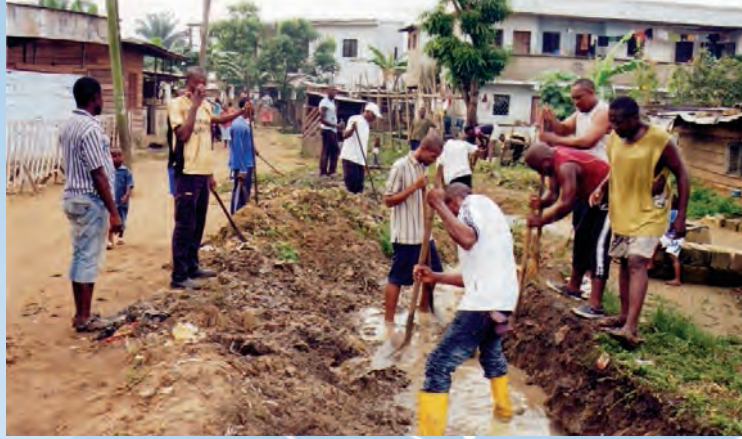
Left: Special workshop for the children of the Central Africa Region in Yaoundé, Cameroon, November 28, 2009 Right: Young members carrying out Service for Peace in Douala, Cameroon, November 23, 2009