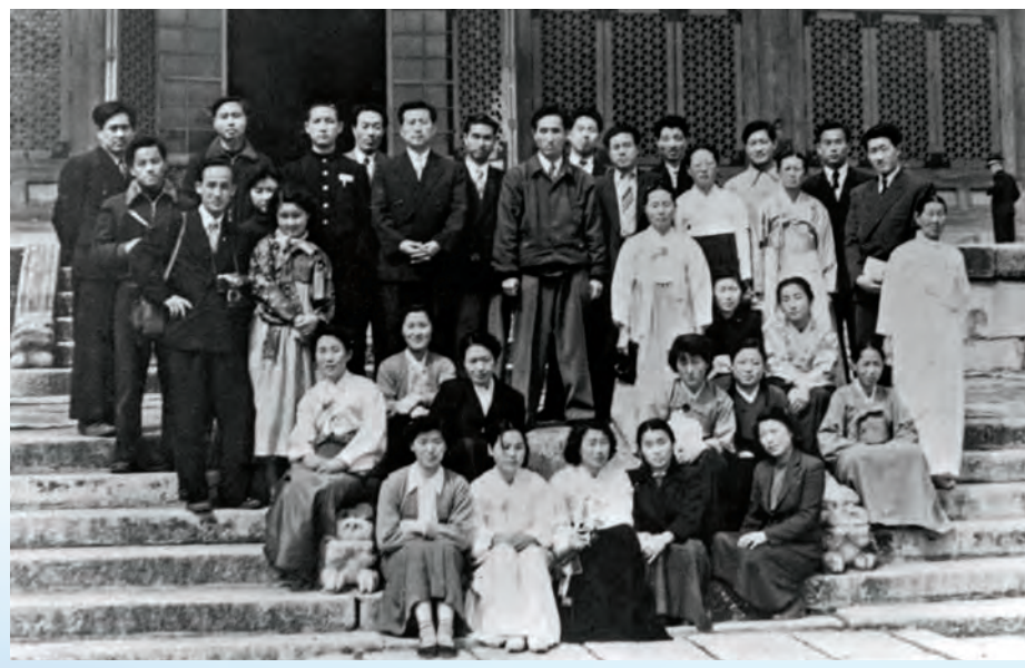
True Father with members at (the rebuilt) Chang Gyeong Palace on March 31, 1955 God, saying "I am still alive, and for this

In serving and following God, I have never once thought about myself. I have always thought I should feel sympathy for Him. I felt like that even when I was dragged to the Seodaemun Police Station and found myself a prisoner behind bars. From the first step I took in following the path of the providence, I comforted