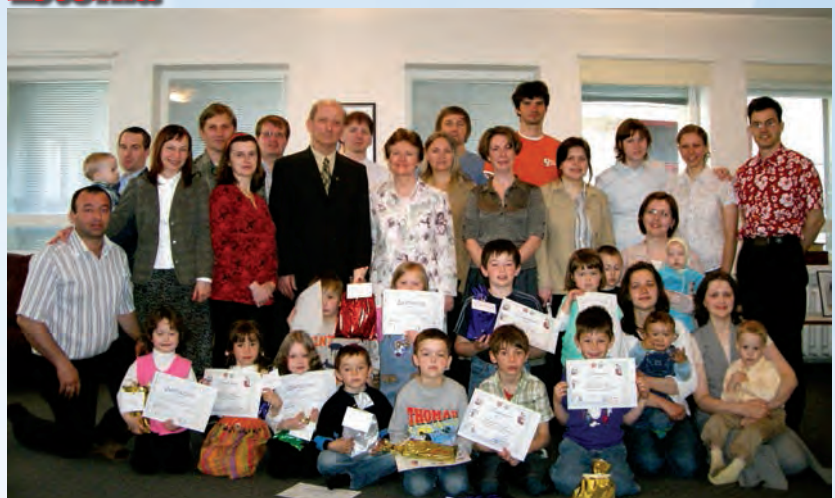
The first Baltic workshop for blessed children, in Tallinn