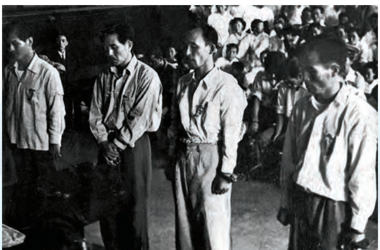
In court during their trial on July 29, 1955; despite the quality of the photo, Father is identified as the man at far right.

So, I told her, "I am not the kind of man who will just fade