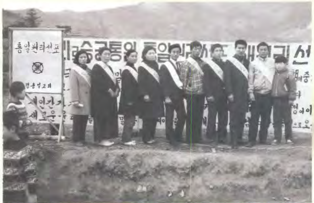
Mobilized blessed wives are among those witnessing in Go-ryeong, Gyeongbok Province

Upon my emphasizing this, they went out for three years, leaving their children behind in orphanages, or in the house of their foul-mouthed relatives with a note saying something like, "This child is my son. Please take care of him for three years until I come back." They left for their mission, leaving behind various tragic situations. ... The mothers in blessed families knew that if they did not take this path, their descendants would suffer much more, so they let go of the children clinging to their skirts, closed their eyes and ran for miles and miles. Who knows the situation of those mothers? Who can know the situation of those parents, who ran over a hill, so that when they were out of sight they would not see their cry-