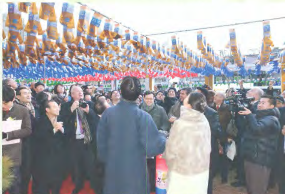
Opening the Cheon Bok Festival: The Lantern-Lighting Ceremony in the Cheon Bok Gung forecourt was attended by many national church leaders, among others. The lanterns remained lit for three weeks, heralding the Messiah's presence among us.