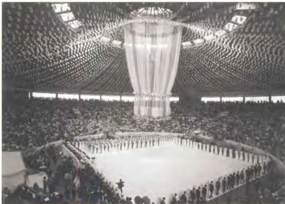
The 777-Couple Blessing Ceremony took place in the Changchung Stadium in Seoul on October 21, 1970. According to an article in the American magazine Time, in which was recorded: "Master Moon intoned: 'Will you swear to love your spouse forever?'"

The Unification Church is sending out missionaries to approximately twenty nations. Within this year we will send missionaries to forty nations. I will do this however much the Republic of Korea opposes us. Are the things that I am doing wrong? It is evident that I have not been wrong until now. So holding on to that history I will go forward. TW