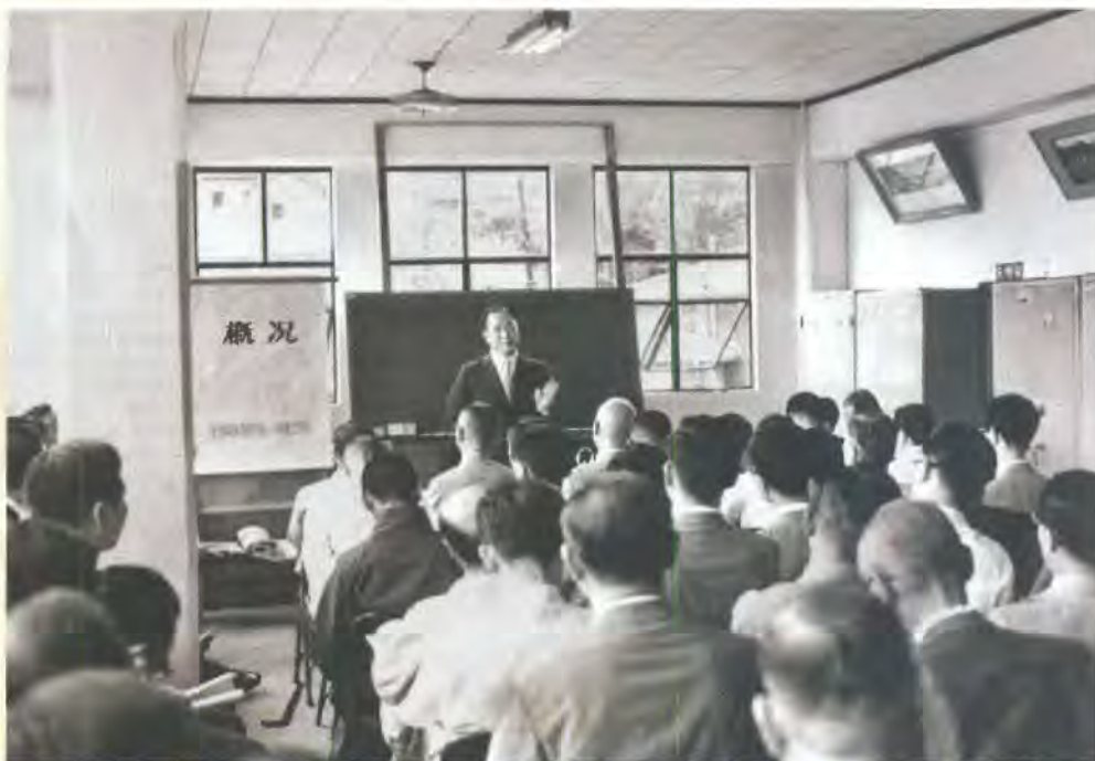
As part of the effort to promote understanding of our church among those of other faiths affiliated with the Association of Religions in Korea, Father invited leaders from those seven religions to our church headquarters and spoke to them on July 15, 1970.

3 Father's reference to Easter is based on his knowledge of the actual date Jesus resurrected. Christians celebrated Easter on March 29, 1970.