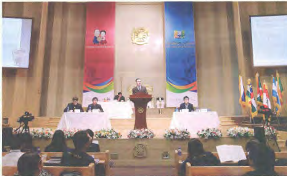
Left: Kook-jin nim speaks at the World CARP Assembly at Cheon Bok Gung on 1.3 (January 25); Right: The assembly featured a debate between students, some supporting the notion that God exists, others arguing against the notion.

mountains, the rivers, and so forth. But it is very different to say that we come from the hands (with their creative power that gave birth to creation) and to say that we come from the essence of God.