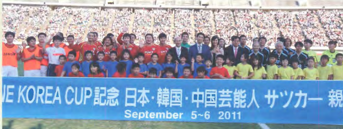
The One Korea Cup in Japan last September brought teams from Mindan and Chongryon into friendly competition. It was when Sorocaba played against the Chongryon team two years earlier that the opportunity for them to play in North Korea was born.

They invited us again the following year, 2010. At that