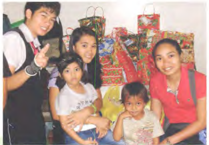
Students at the International Peace Leadership College ran a voluntary project to help local children last Christmas.

After another year of operation, we will open our admissions to international students. That will certainly add spice to our