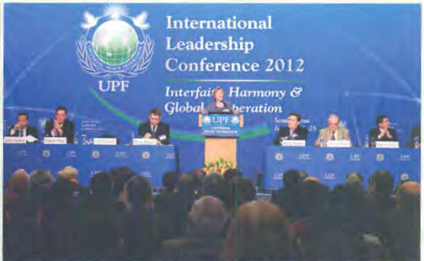
International Leadership Conference (ILC) 2012 was held from January 21 to 25 at the Lotte World Hotel in Seoul. Cheon Bok Gung hosted the opening plenary, which included religious leaders' prayers and participants' remarks on the cause of peace.