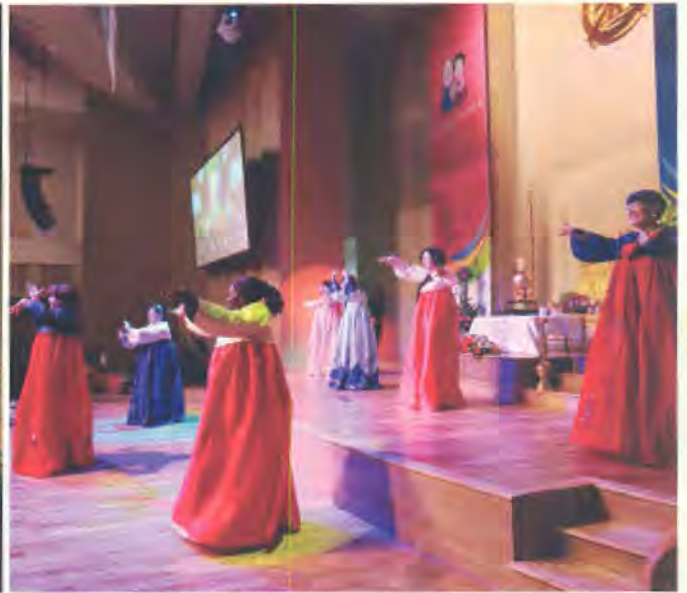
Multicultural Festival: Featuring dance and song as expressions of joy over True Parents' births, it took place on 1.6 (January 28); Left: Russian children perform a folk dance; Right: International Women in Korea members lead the audience in modern dance.

go to True Parents and ask their permission to make it into a small pilgrimage around Korea. I brought this petition to True Mother, but True Mother said, "You must make a strong statement!"