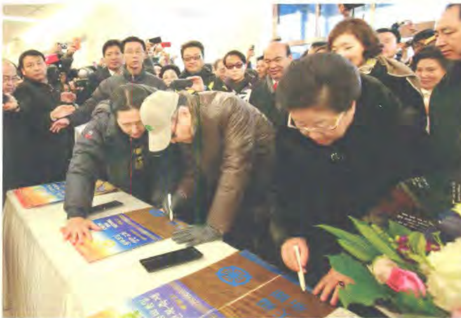
1.2 (January 24): After arriving at Cheong Bok Gung, True Parents wrote a message on lanterns to be hung with the hundreds of others in the forecourt.

was thinking that this was maybe sung-sang and hyung sang (internal nature and external form), or masculine-feminine, dual characteristics again. But then he said, "I am managed by the God of Night. You all (the world) are managed by the God of Day."