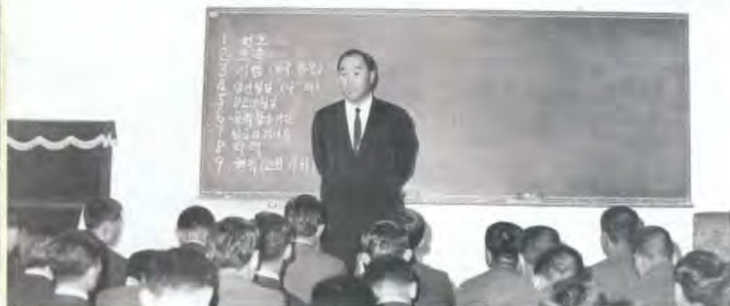
Right: Father speaking at the second workshop for matching candidates preparing for the 777-Couple Blessing Ceremony; on the blackboard: 1. Membership number 2. Local church 3. Name 4. Date of Birth 5. Date of joining the church 6. Length of time in a public mission 7. Number of spiritual children 8. Educational level 9. Current occupation

tional authority. Next is the world. We should advance to the world after laying a successful foundation based on the Asian cultural sphere.