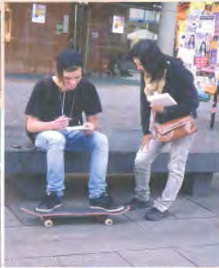
Young Korean and Japanese members signed on to spend a year witnessing in Australia; Here, two of them are hard at work on the streets of Sydney.