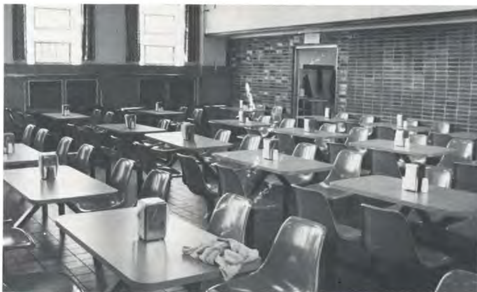
Father always kept the cafeteria at Danbury spotlessly clean and in order.