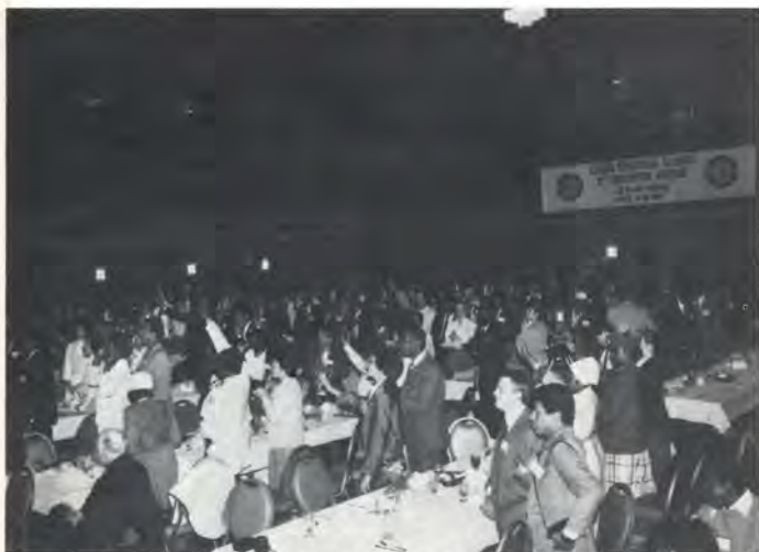
Almost 500 guests attended the first New York CMA Convention at the Manhattan Center.

very serious about making God and the church the center of their family life, and she feels that the only way to stem the dissolution of families today is to bring our communities back to God.