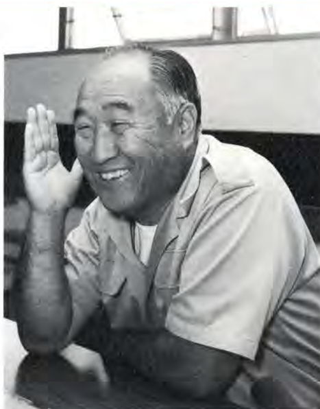
Father giving a rare interview in the visiting room at Danbury prison.