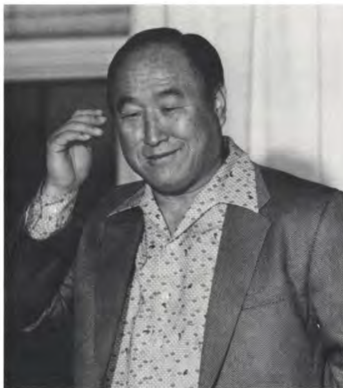
NEW FUTURE PHOTO

As the Principle explains, the fruit of the Tree of the Knowledge of Good and Evil means the fruit of love between a man and a woman. If you think that because you are blessed, the fruit of your love does not carry the