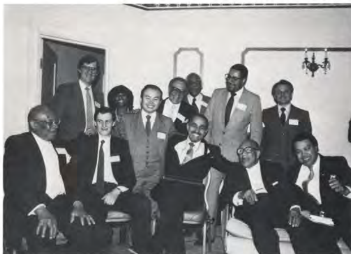
Some of the speakers at the CAUSA Convention with the convention organizers.

He spoke about the need for prayer. "Prayer puts you in shape to be one of accord," he said. "The most important thing is for all the churches to get together. Ministers should not listen to other people talking CAUSA down and telling us not to go. The important thing is to get back to one accord and take these