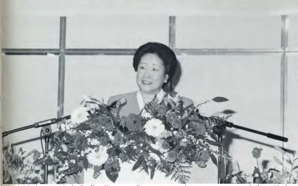
Mother speaks in Berlin, Germany, European members were so appreciative of being with her, many for the first time.

hundred. Due to cancellations in Lille, we had to hold the speech in an unadvertised place and transport people from the original site. For me, as an American, to see that such persecution still plagues our French members was most saddening. Many efforts were blocked due to political pressure. The socialist government of France caused many problems for us, including the interception of a vehicle bearing simultaneous translation equipment from a company we contracted with. So we did without. Lille was