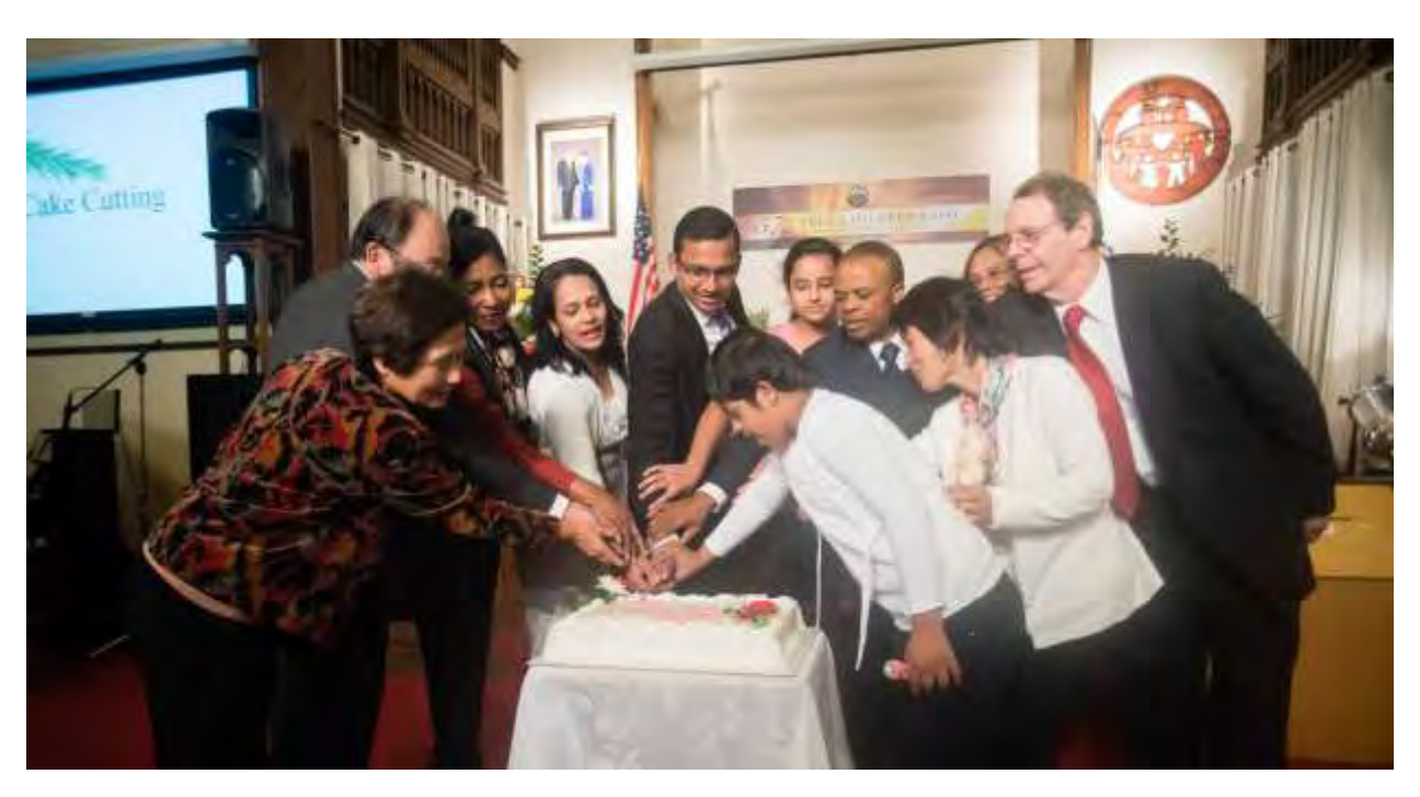
The Clifton Family Church held their True Children's Day celebration on October 30. The community shared a meal, prayer, message and beautiful offering table.