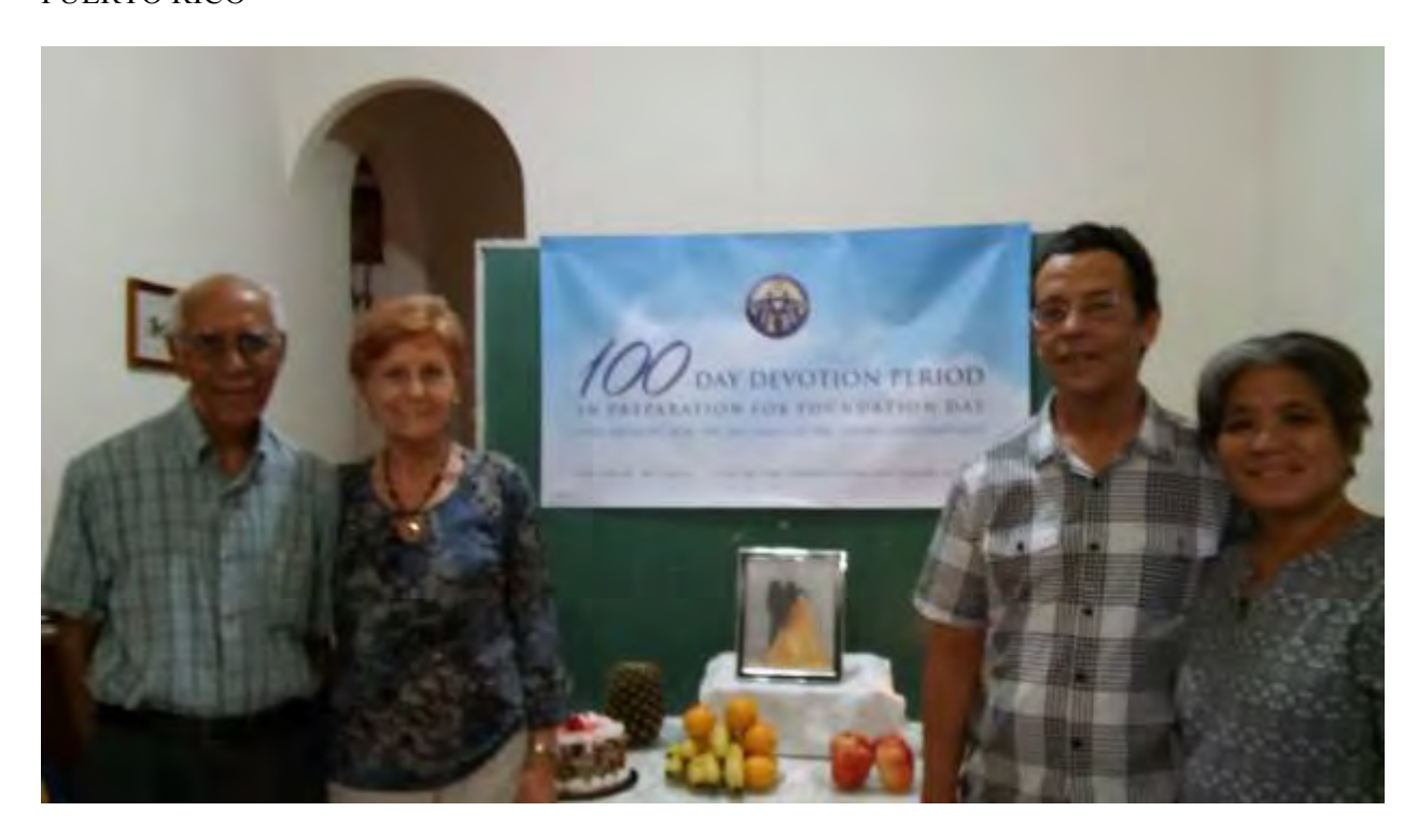
Two Unificationist families came together to present a beautiful offering table for the kick-off of the 100-day devotion in the home of one of the families.