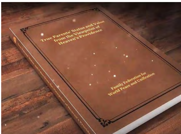
A pre-publication version of "True Parents' Status and Value from the Viewpoint of Heaven's Providence"

I was surprised by these words and at the same time quite fearful, but gathering courage, I worked with professors from both Sun Moon University and Cheongshim Graduate School of Theology. We focused on developing teaching materials that could convey the "essence of the True Parents ". After six months of sleepless nights and sacrificing weekends, the professors finally completed the teaching materials.