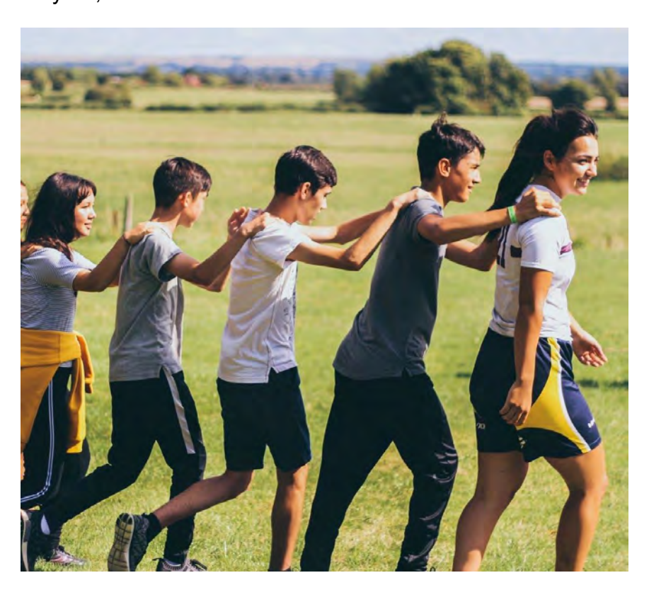
We are delighted to announce our upcoming Junior HARP UK Summer Workshop. Read more below!