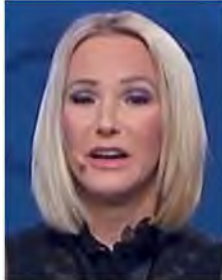
Paula White-Cain.

Paula White-Cain, American televangelist and advisor to Donald Trump during his presidency, said,