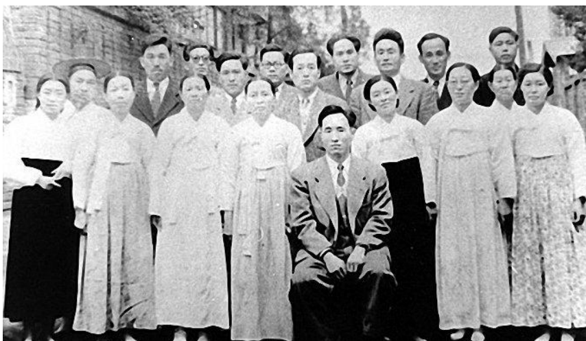
Members assembled when what is now called the Family Federation was founded 1st May 1954. Father Moon seated in front. Photo taken in Bukhak-dong, Seoul 3rd May 1954

political leaders from around the world.