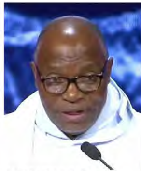
Archbishop Johannes Ndanga.

I also came to realize the maternal aspect of God through Mother Moon , the Only Begotten Daughter . This is indeed a great blessing and amazing grace, not only for me, but for all religious people who believe in God ."