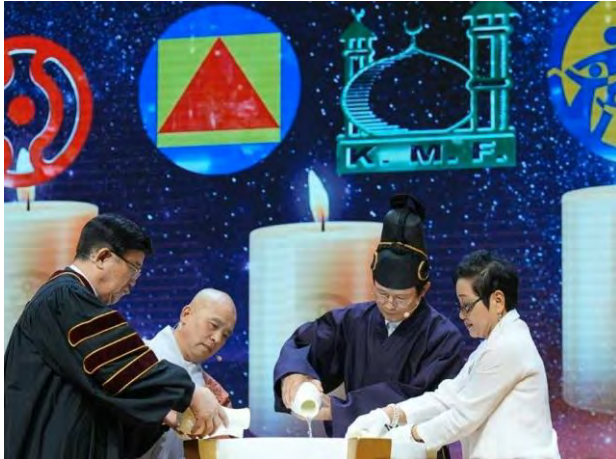
Religious leaders performing a ceremony for unity 6th June 2024