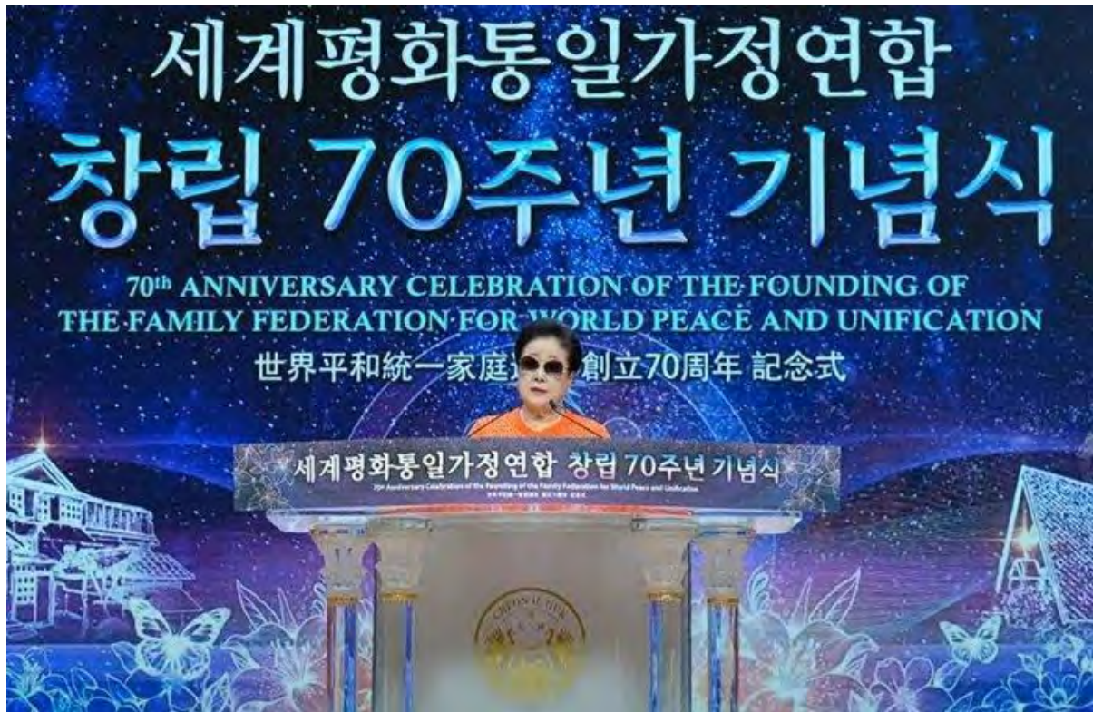
Mother Moon speaking on 6th June 2024 in Gapyeong, South Korea

She encouraged all members to fulfill their responsibilities and contribute to the great task of realizing a unified Korea and a unified world.