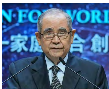
Soo-sung Lee, Prime Minister of South Korea 1995-1997