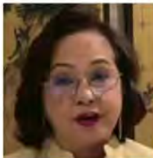
Gloria Macapagal-Arroyo.

Gloria Macapagal-Arroyo, President of the Philippines 2001-2010,