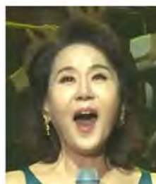
Mi-ya Park. Screenshot