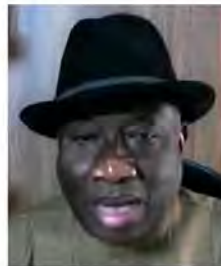
Goodluck Jonathan.

"The True Parents' Holy Wedding anniversary serves as a beacon of hope and inspiration, reminding us of the importance of love, unity and family bonds in fostering a more peaceful world."