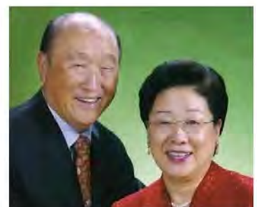
Father and Mother Moon

The significance of this special term is that God has finally been able to have a son and a daughter who have become the True Parents of humankind. Jesus only became the spiritual father of those who believe in him, because he never could hold the "Marriage of the Lamb". In other words, God had to wait for thousands of years before this ideal that True Parents represent could be realized. True Parents represent the very source of true love , true life, and a true lineage. It is only through True Parents that humanity may return to God and become true sons and daughters.