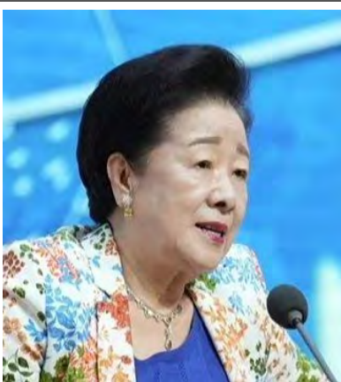
Mother Moon speaking in South Korea

[...] I think it's really important to take some time to digest and think about what True Mother shared with us last night. For myself, I always think about this word "substantially".