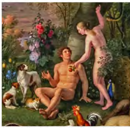
Adam and Eve in Paradise. Cropped

Because of the fall, we humans lost our originally intended position as true sons and daughters of God , who would have given them the stewardship of earth and heaven. Instead, the first humans fell to an incredibly low level when they were led astray by the archangel Lucifer and came under his dominion. Angels were created to be servants of God and human beings. We humans were created to be children of God . Instead, the first man and woman followed a rebellious angel and thus became the servants of a servant.