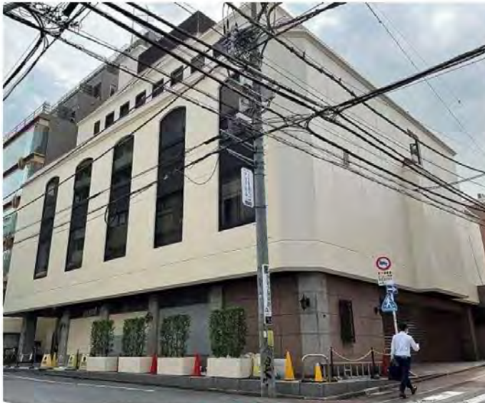
Tokyo headquarters of the Family Federation of Japan . Photo: Asanagi / Wikimedia Commons. Public domain image. Cropped

Fukuda writes that the Family Federation believes NHK's intent was not to show support for the organization but rather to inform the public about its actions. NHK likely wanted to underscore the discrepancy between the federation's public commitment to "cooperate sincerely" with the questioning process and its behind-the-scenes efforts to resist a dissolution order.