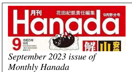
September 2023 issue of Monthly Hanada

Japanese state meddling in the work of journalists and editors