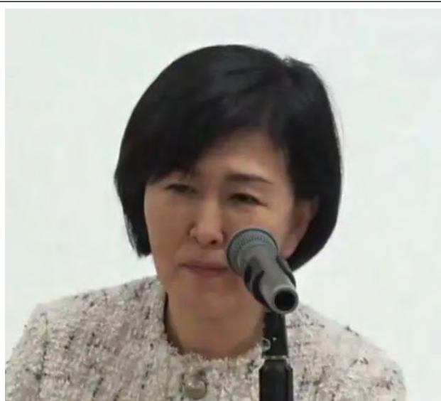
Investigative journalist Masumi Fukuda, here speaking in Tokyo Dec. 25, 2024

See also State Scolds Big NHK for Reporting Other Side