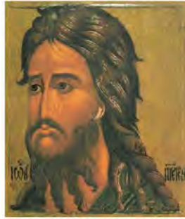
John the Baptist, 16th Century Russian icon painting in the Russian Museum. Public domain image. Cropped

It's important that we understand that the True Parents and Jesus were doing so many things to reach out. But important people like John the Baptist did not recognize their responsibility , and therefore Jesus was rejected.