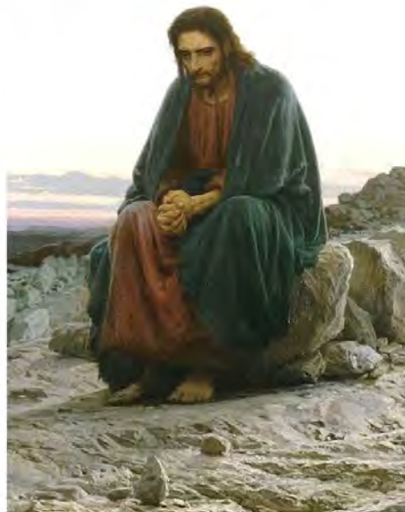
"Christ in the Wilderness", by Ivan Kramskoi (1837-1887). Painting in the Tretyakov Gallery in Moscow. Cropped

The famous painting "Christ in the Wilderness", by the Russian artist Ivan Kramskoi, is one of the pictures I feel represents Jesus. This is when he was in the desert fasting and praying for 40 days in order to make a new foundation . You can sense the sadness in his heart.