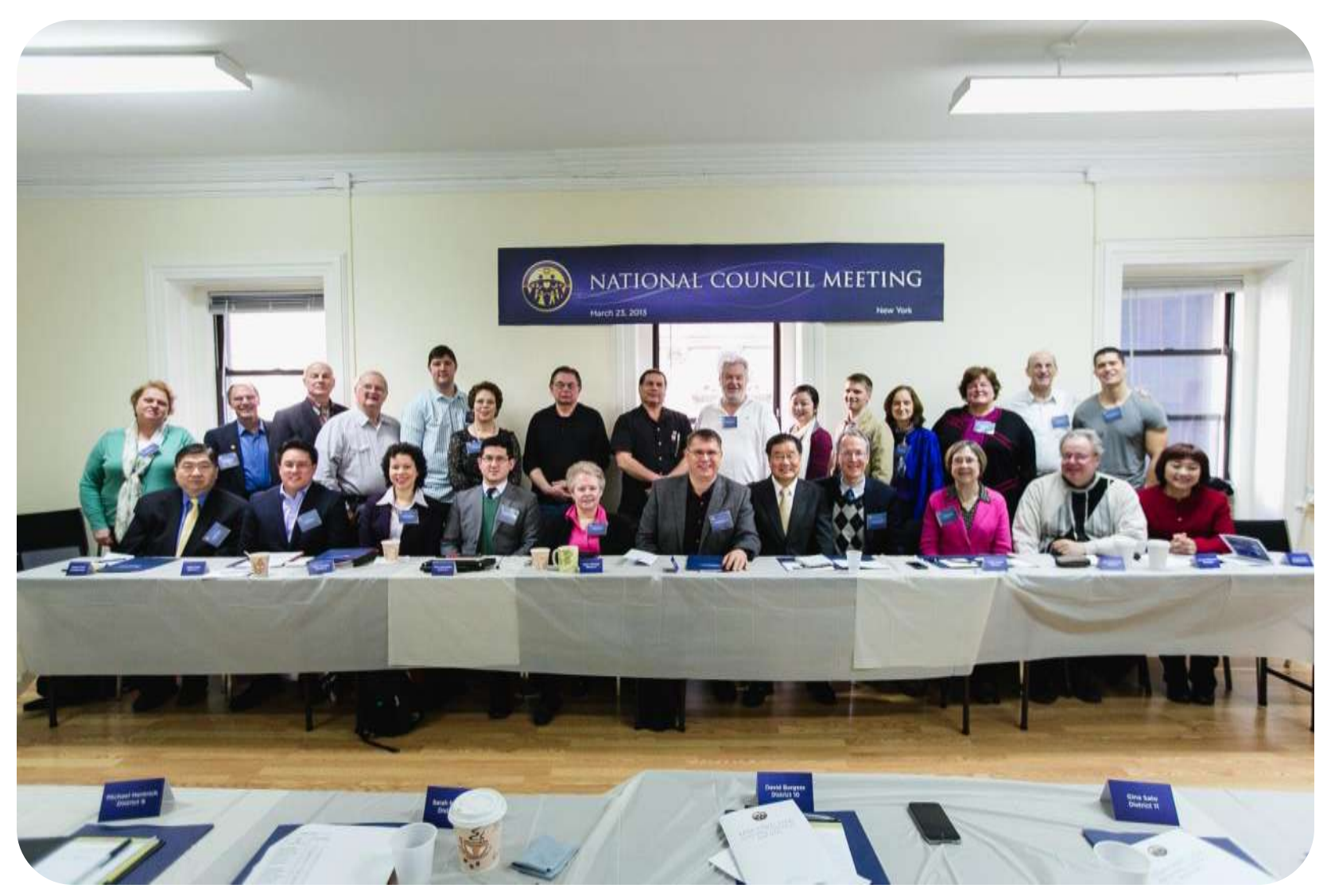
Group Photo of the First National Council