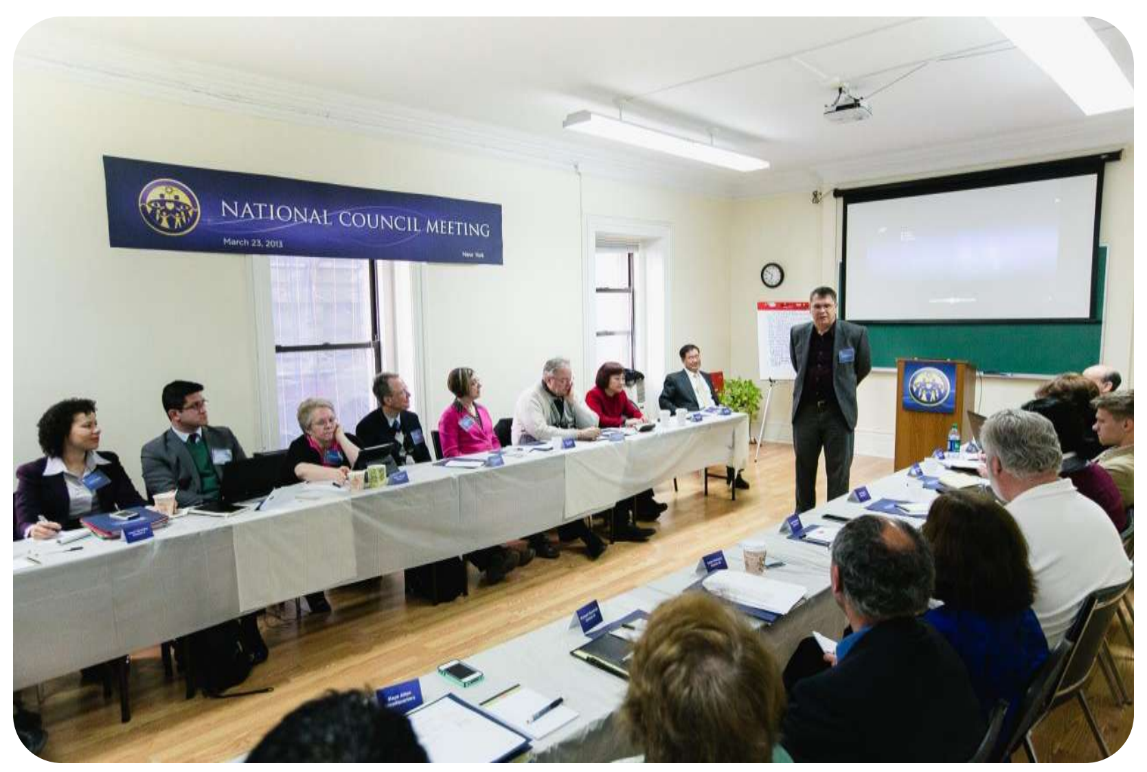
Explaining expectations for the weekend program