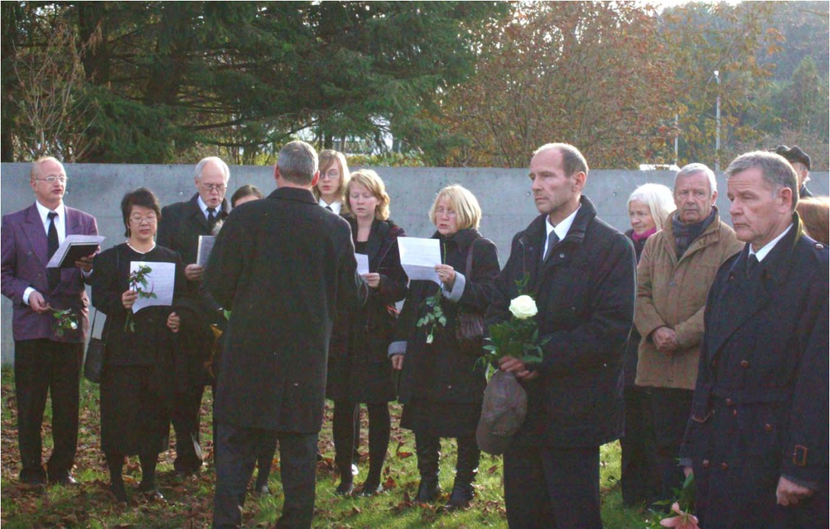
The choir singing at the burial ground in the warm afternoon sun of the beautiful autumn day