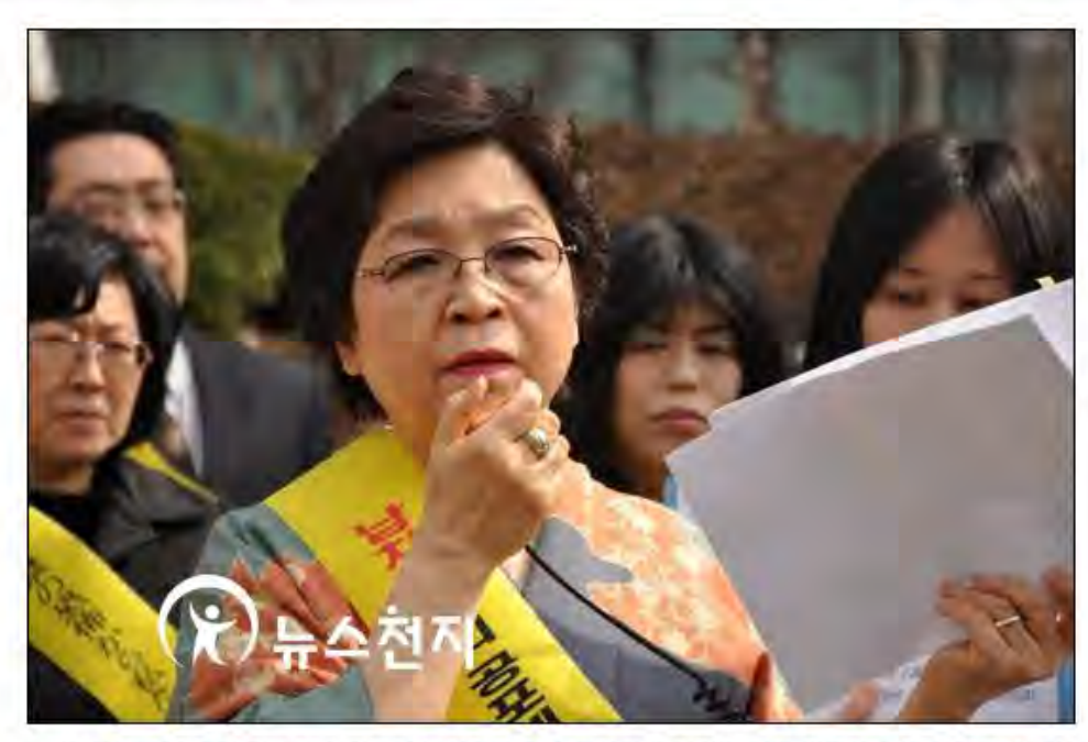
▲ '대책위' 에리카와 먀스에 위원장이 납치감금 피해 사례를 들어가며 일본 당국에 사건 해결을 호소하고 있다. ⓒ천지일보(뉴스천지)

[뉴스천지=이길상 기자] '일본 통일교인 납치감금으로 인한 한국 인권피해자 대책위원회(대책위)'는 23일 일본대사관 앞에서 기자회견을 열고 일본에서 벌어지고 있는 통일교 신도 납치감금 사건에 대해 일본 정부가 법에 따라 해결해 줄 것을 호소했다.