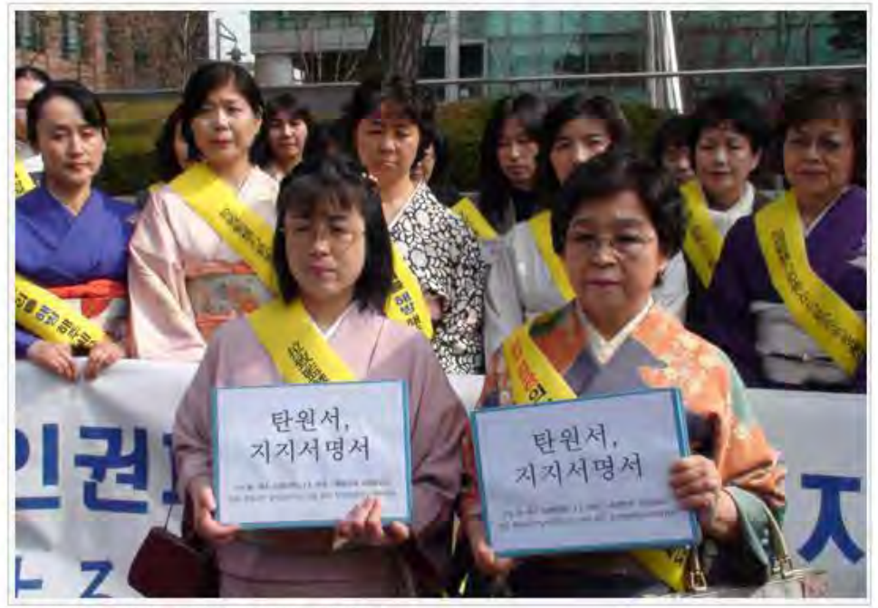
🛄 인터넷에서 내 주민번호가 도용 당해?

이들은 또 "신앙이 다르다는 이유로 일본의 일부 <u>개신교</u> 목사와 상업적 성향의 변호사, 좌익 성향인사들이 강제로 개종작업을 벌이고 있다"며 납치감금 문제 해결을 요청하는 탄 원서를 일본대사관에 제출했다.