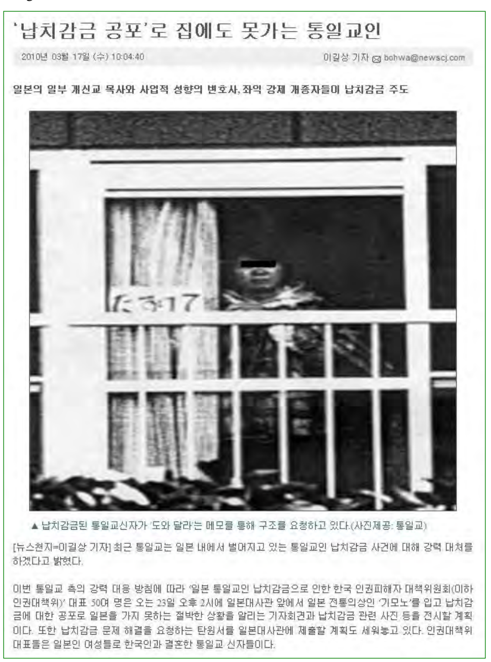
▲ An abducted follower of the Unification Church pleads for rescue with a sign that reads "Please help me"

believers in the Unification Church who cannot visit Japan for fear of being abducted—will be holding a press conference in front of the Japanese embassy at 2 pm on March 23^{rd} in traditional national costume. They will inform the public of the desperate situation of their being unable to visit Japan for fear of being abducted and confined, and will exhibit related photos related to the kidnappings and confinements. They also plan to present a letter of appeal to the Japanese embassy, asking their government to solve the abduction issue. These Japanese women representatives of the human rights committee are followers of the Unification Church with Korean husbands.