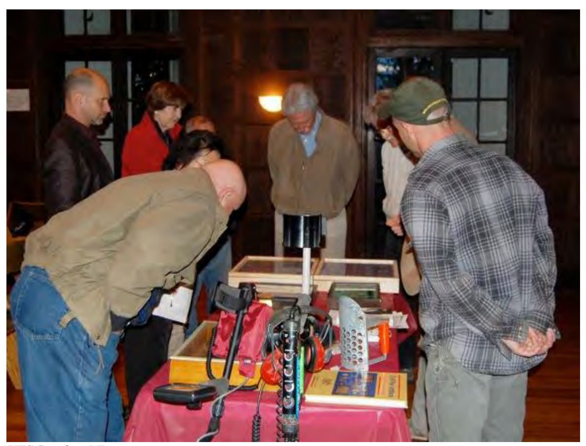
UTS Speakers' Forum guests

Metal detectorists are sometimes considered by archaeologists as no more than "grave robbers" because they think that they are just interested in finding "treasure" and selling it for a profit. Actually, metal detectorists are very interested in history and telling the story of that history through the relics and artifacts they find. They carefully record where they found certain artifacts, and often put them on public display or go to schools to give presentations about the historical significance of the dug artifacts. They are also often called to help find lost jewelry, property markers and other things buried or lost in the ground. Just the other day, one of the Barrytown club members found a high school ring lost by the sister of a prominent member of Red Hook, which she lost on the family farm over 40 years ago! Was she delighted and grateful to get that ring back!