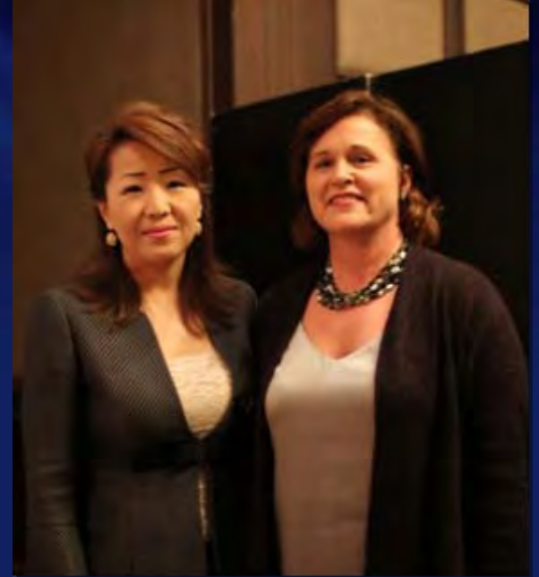
Mrs. Dorothy Bush Koch