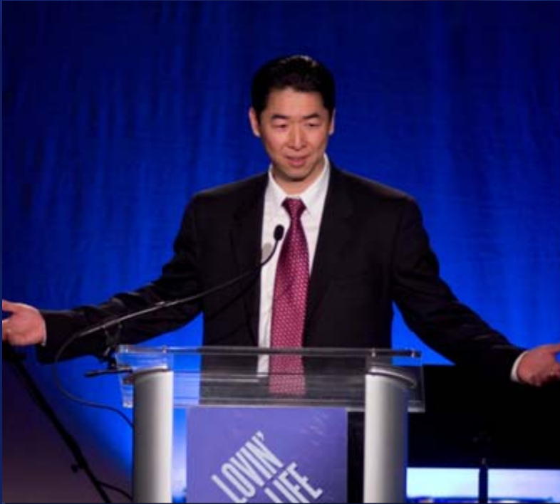
Manhattan Center, New York, December 19