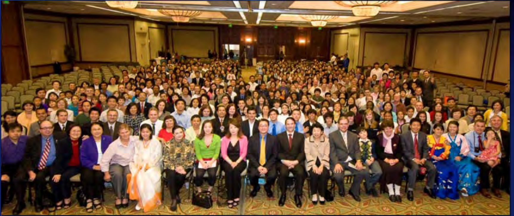
National Listening Tour, 2008-2009