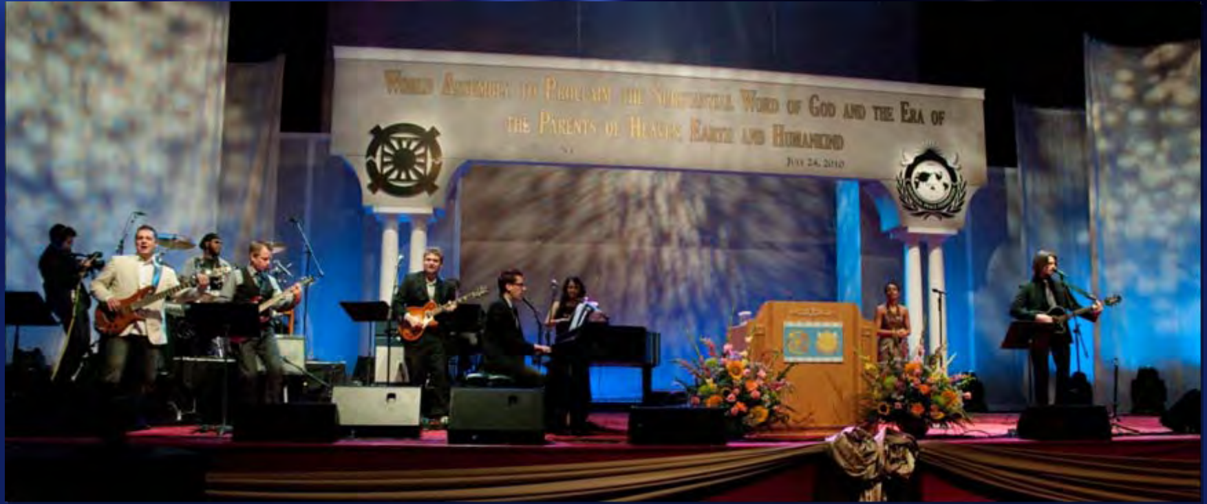
Lovin' Life Band ( Sonic Cult )