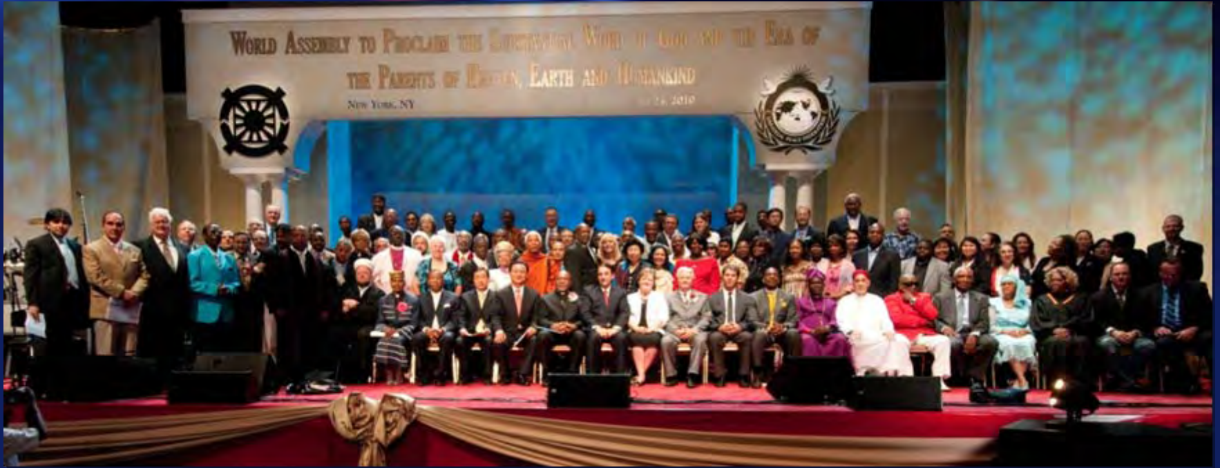
Ambassadors for Peace and Faith Leaders