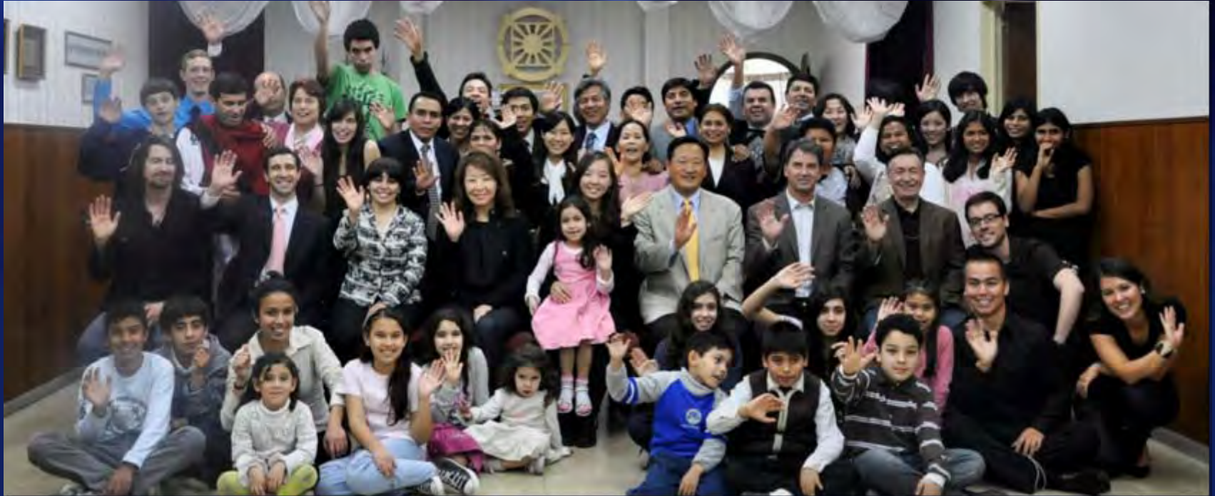
With the Argentina Blessed Families