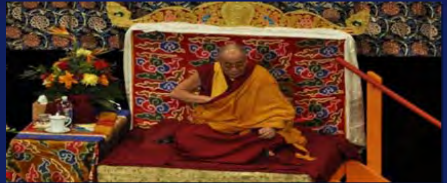
Pres. Barack Obama, French Pres. Nicolas Sarkozy, The Dalai Lama