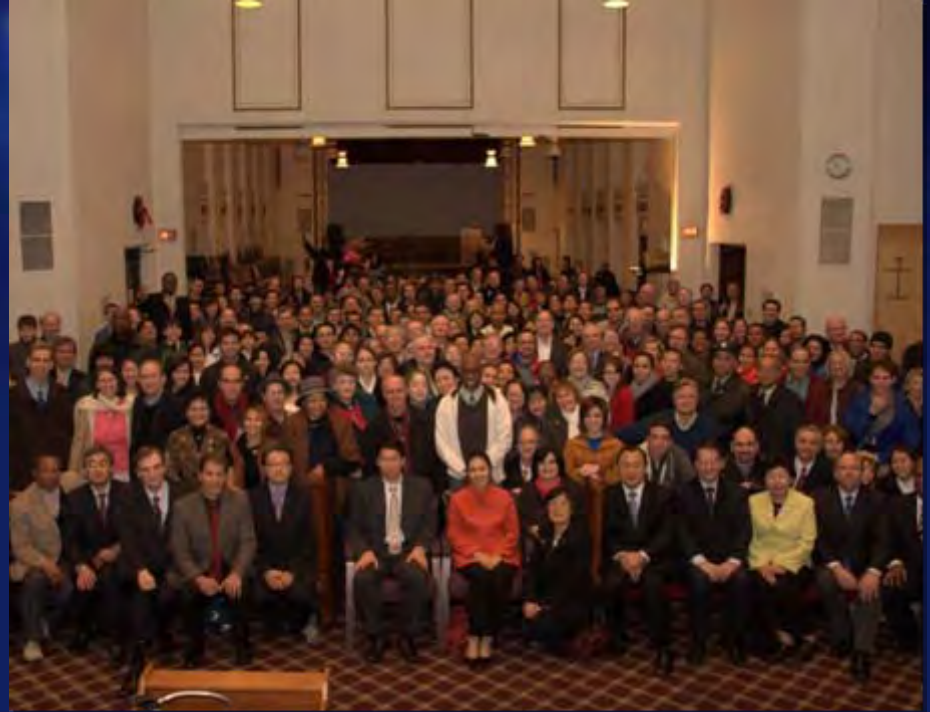
Washington D.C., December 20