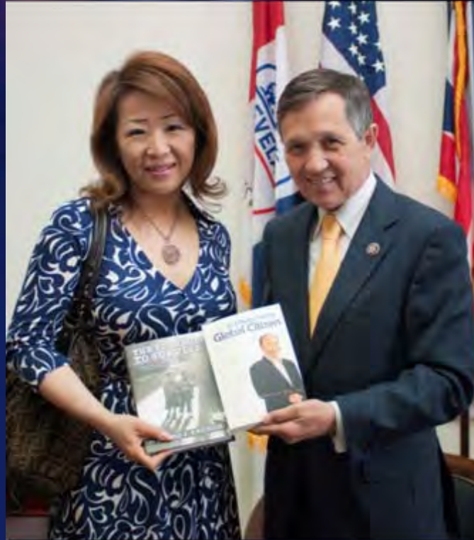
Congressman Dennis Kucinich (D-Ohio)