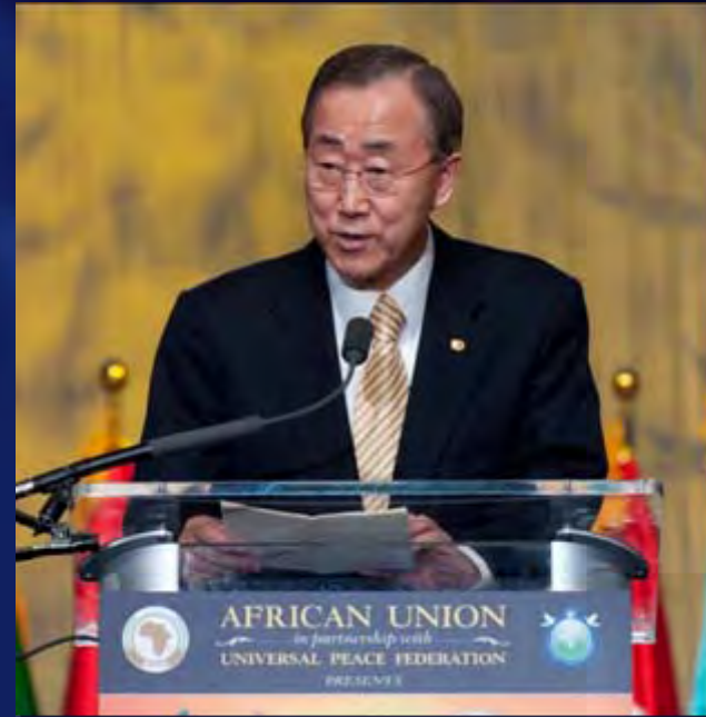
Hon. Ban Ki Moon, UN Sec. Gen.