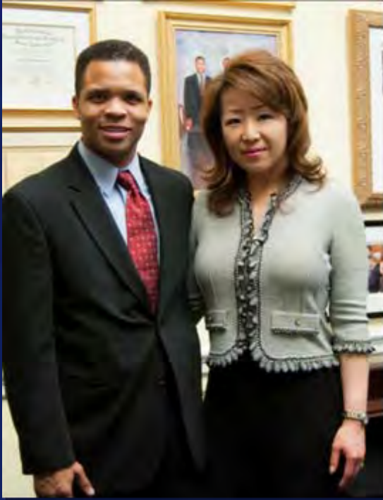
Congressman Jesse Jackson, Jr. (D-IL)