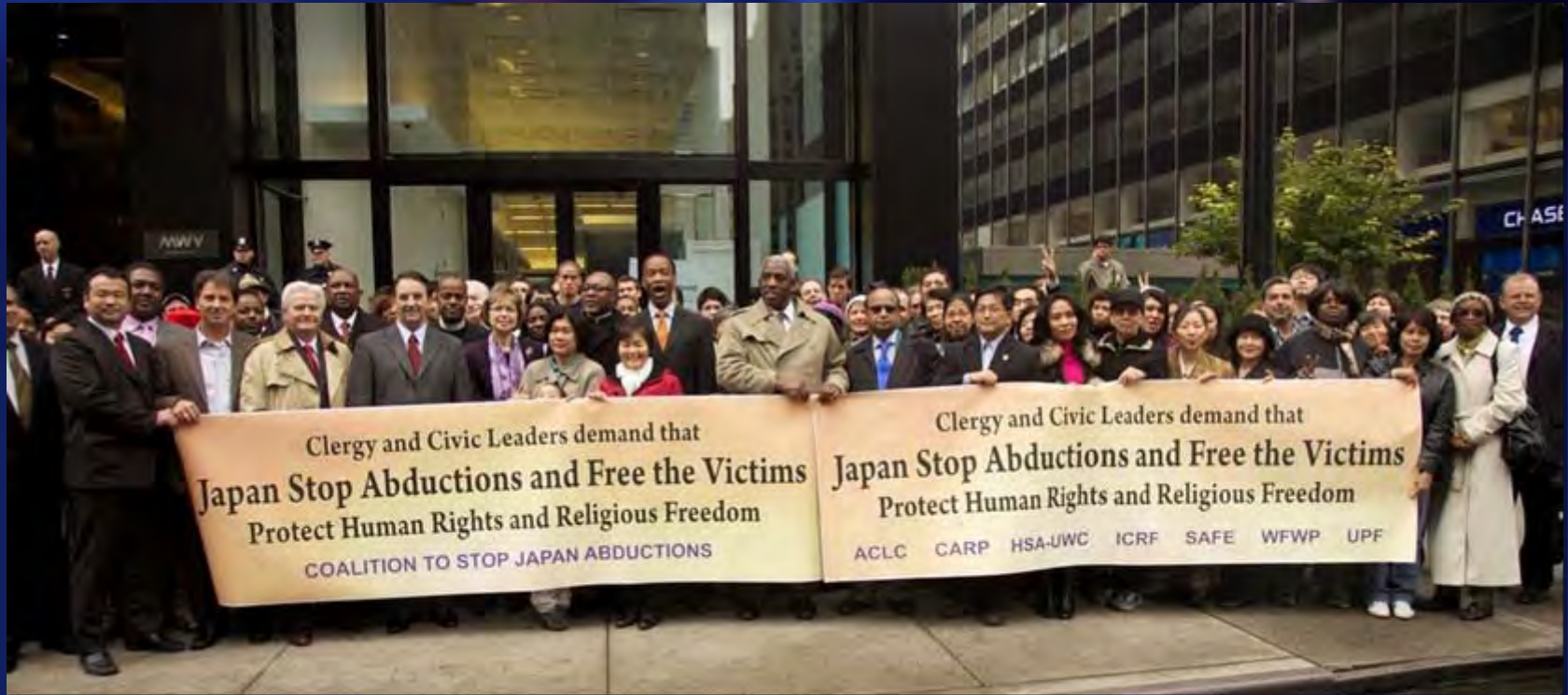
Japanese Consulate in New York City