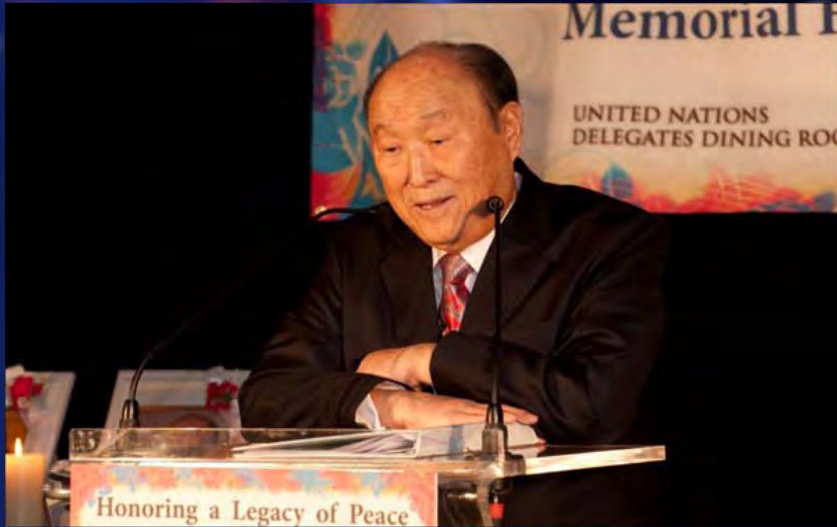
True Father Speaking at the U.N.