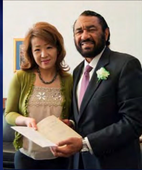
Congressman Al Green (D-TX)