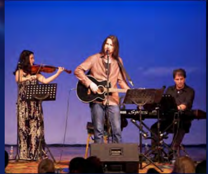
San Jose, Costa Rica