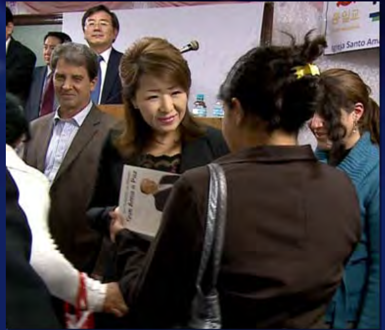
Honoring a Legacy of Peace event in Sao Paolo, June 6, 2010