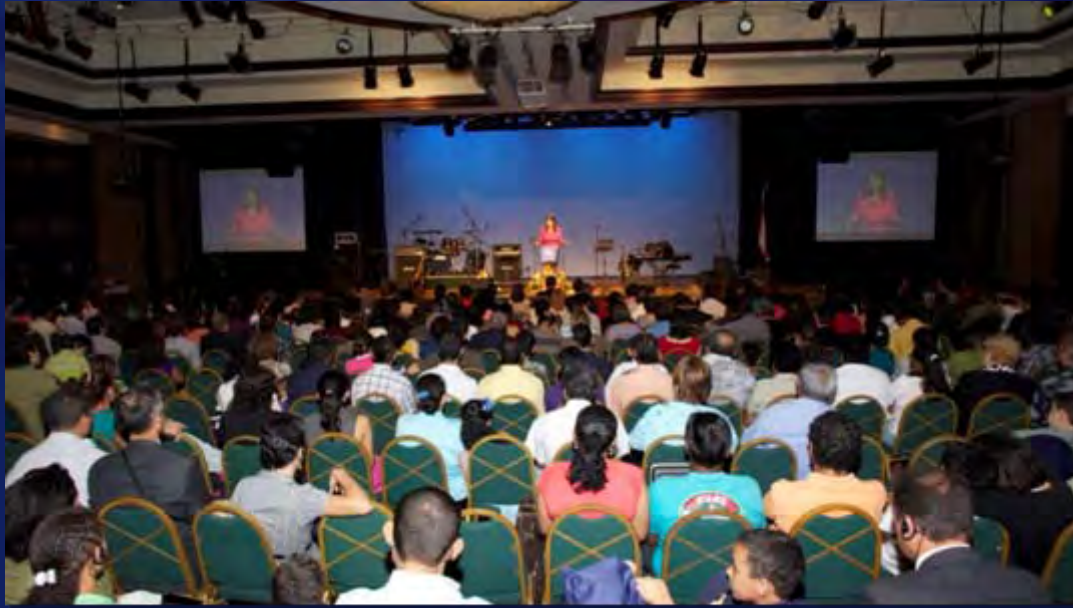
Ramada Plaza Herradura