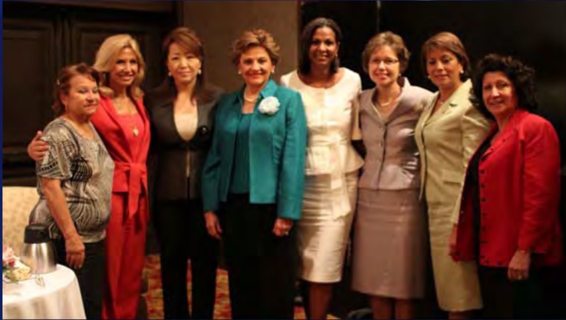
Current and Former First Ladies of Latin America