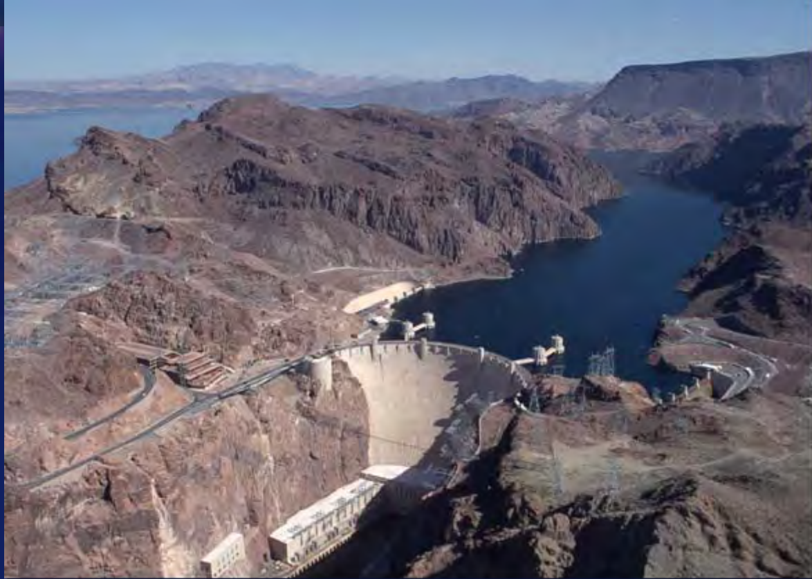
Hoover Dam and Lake Mead