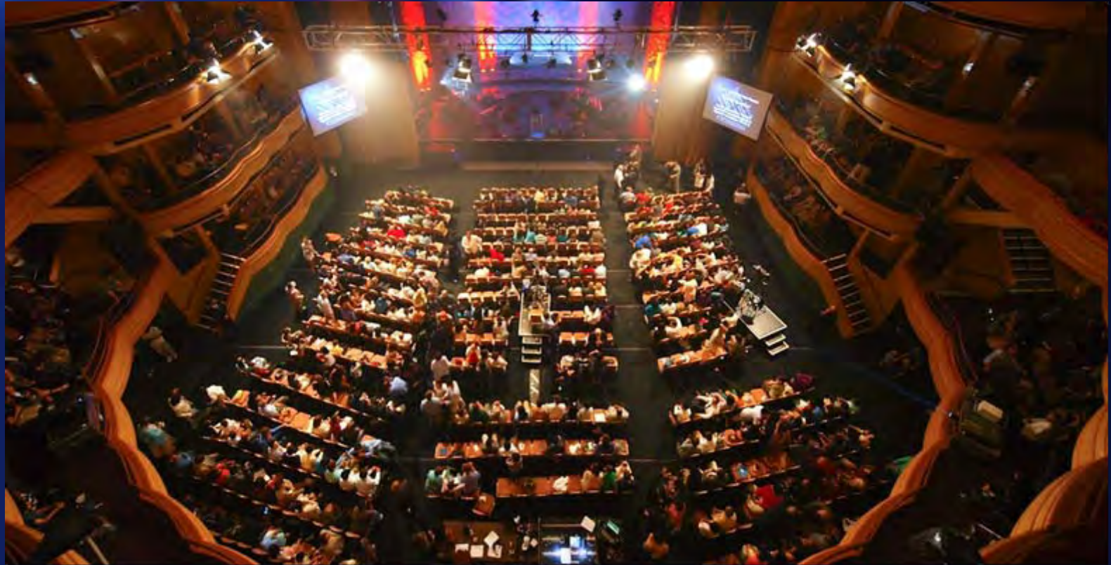
Grand Ballroom (Home of Lovin' Life Ministries)