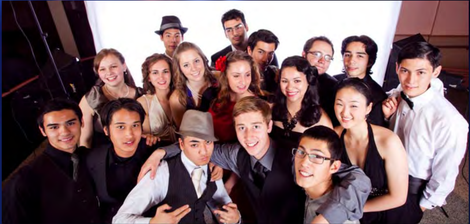
CARP Winter Ball