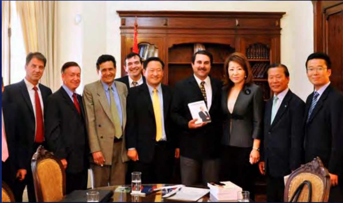
Hon. Federico Franco, Vice President of Paraguay