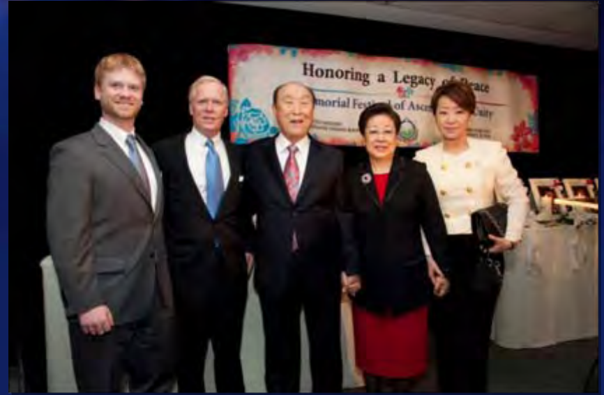
March 18, 2010