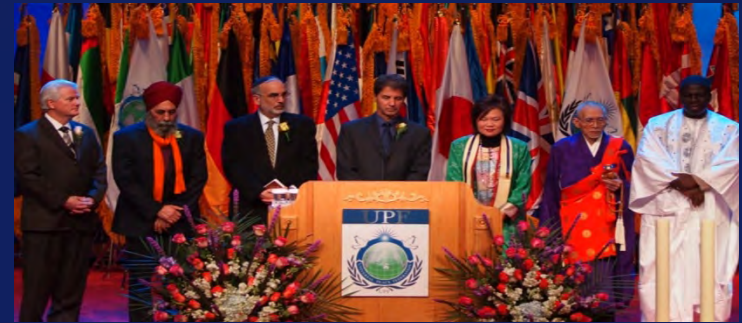
New York, Nov. 22, 2010