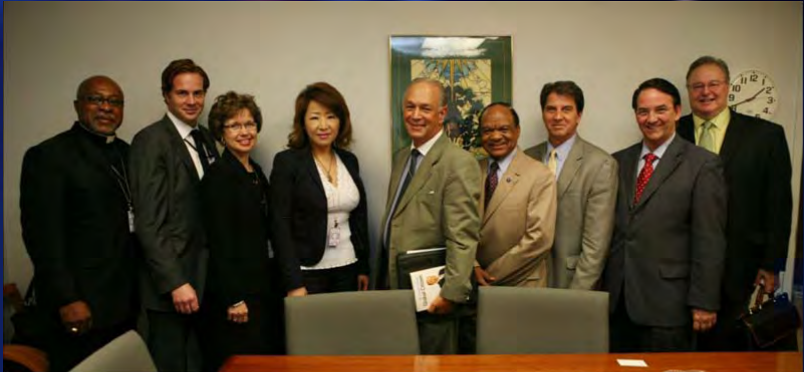
Meeting with Director of State Dept. Committee on Human Rights and Religious Freedom