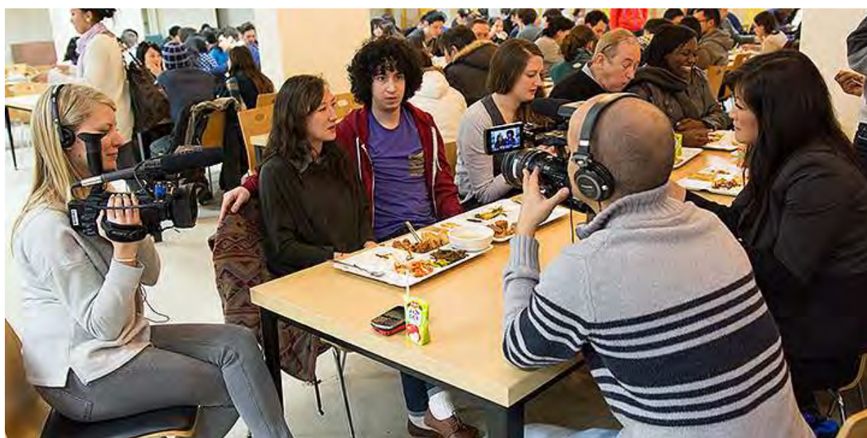
ABC News interviews second generation Unificationist couple during their lunch break at the Blessing Workshop, Korea.

Looking out at the crowd, you could see the 200 some people gathered, of all different backgrounds, races, and cultures. As one of the staff mentioned in their opening remarks, "It is inspiring to know that we are able to come together because of our True Parents."