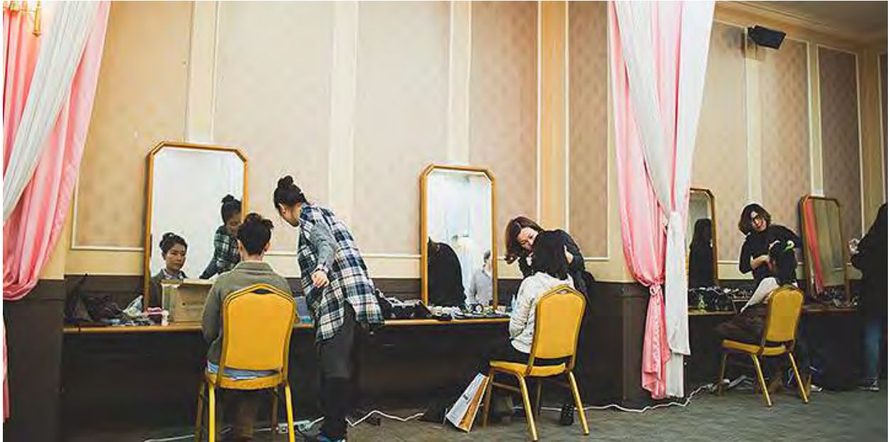
The brides gather to have their hair and make-up done

The preparations will go on long into the night—ironing and steaming suits and dresses. Hair and makeup appointments began at 8 pm and are still going on as I write this. The brides are planning to sleep with their hair done and makeup on. They'll be off to an early start tomorrow—the first buses will depart from the condo at 5:30 am to take the couples and family members to the stadium for the long awaited moment.