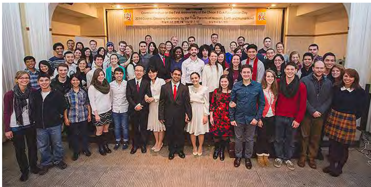
The brides and grooms from America.