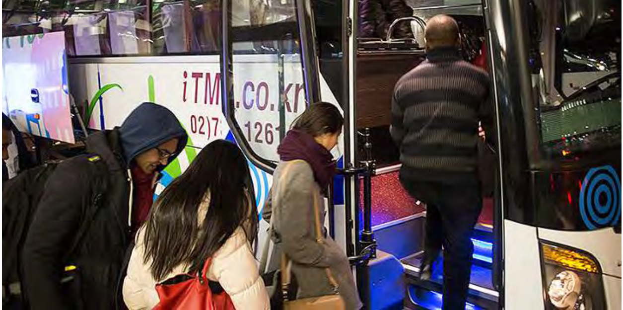
Brides and grooms from America board the bus from the airport to HanWha Condo.

not ready to make this commitment should feel free to go.