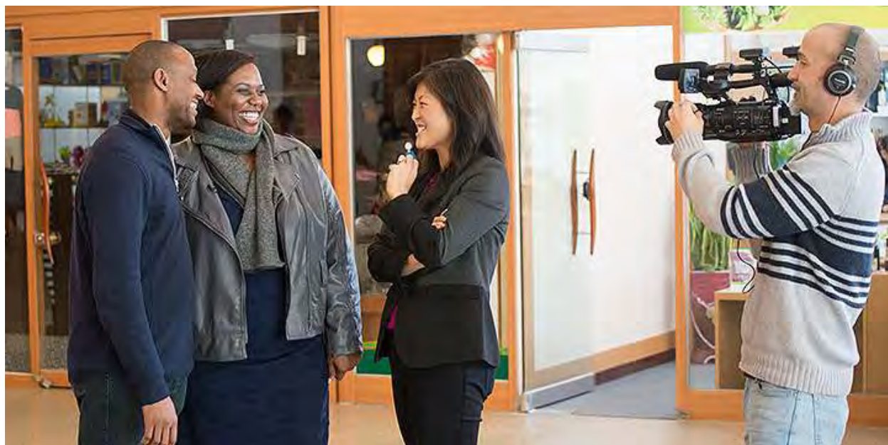
ABC News interviews couples participating in the 2014 Cosmic Blessing on February 12 in Korea.

able to keep their eyes open as they received their room keys and registration information. Our BFM staff answered many questions throughout the day, like... "Where can I find an iron?", "Where can I buy Blessing rings?", "Where can I find Wifi?", and "How can I connect my family back home to the broadcast of the ceremony?"