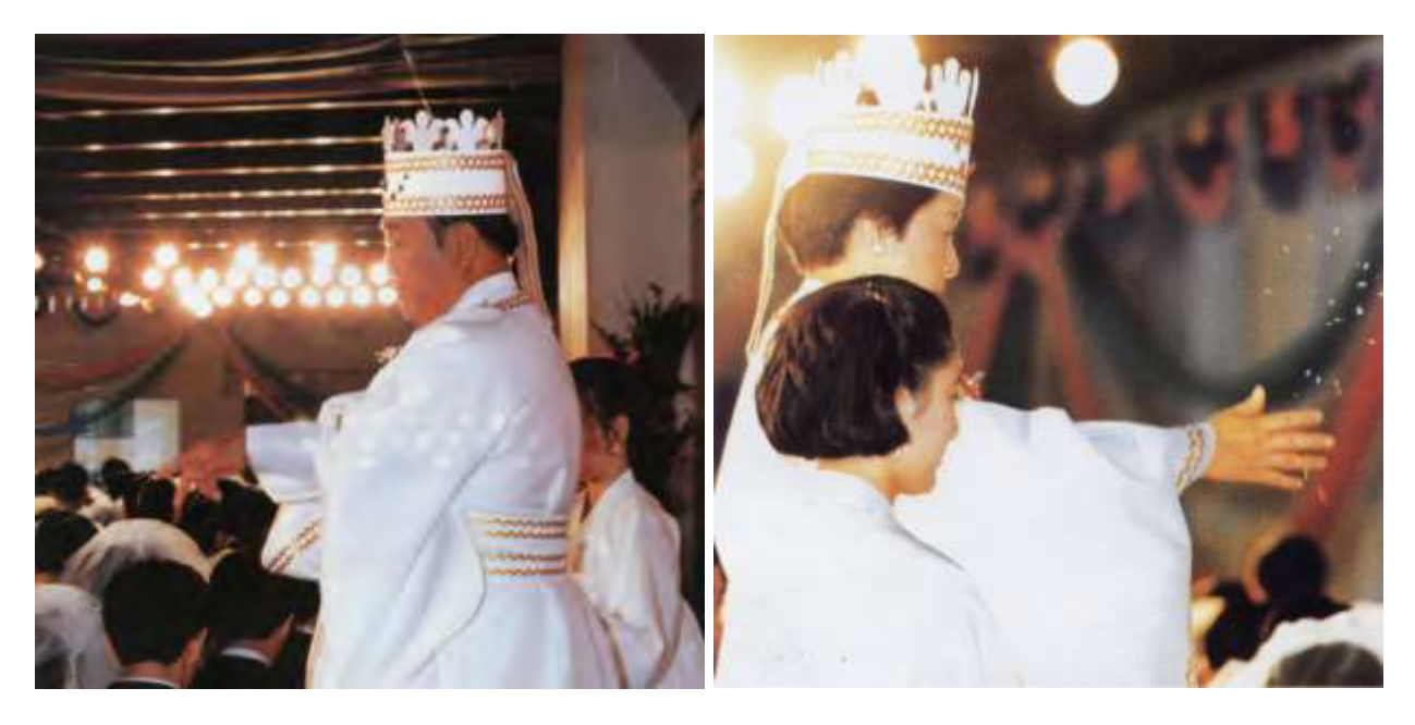
The Significance of the 6,500 Couples Marriage Blessing in True Father's Words

On October 30th, 1988, True Parents blessed in marriage 6,516 couples in a Holy Marriage Blessing Ceremony conducted in the complex of Ilhwa facility in Yong-in, Korea. The ceremony was significant in that it brought together some 2,500 Korean-Japanese couples. As True Father noted, "Korea and Japan have been enemies for a long time, and their animosity has never been healed. Through this engagement ceremony, emotional strains and hurt will be removed, and the fortunes of these two nations will begin to take root on earth." True Parents conducted this Marriage Blessing Ceremony in conjunction with the Seoul Olympics. It was the ninth Marriage Blessing Ceremony following True Parents' own Marriage Blessing Ceremony and the Marriage Blessings of 3, 36, 72, 124, 430, 777, 1,800, and 8,000 couples.