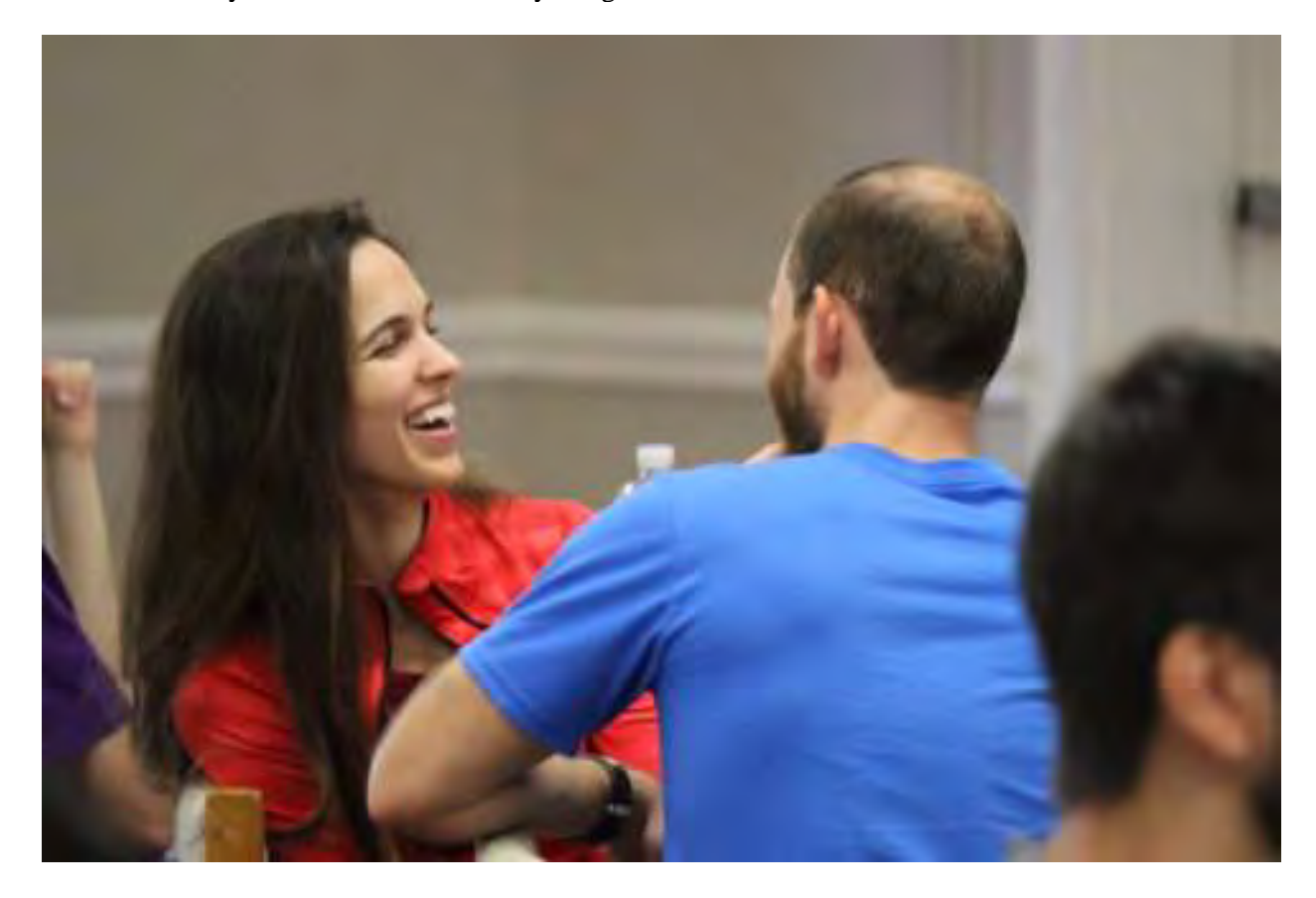
"The workshop was well organized and had just the right mix of heartfelt, spritual, and practical content. I gained a lot more than I expected and feel it will help both me and my fiance Start Smart."