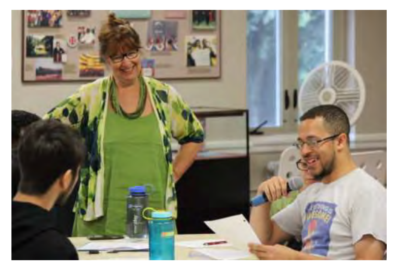
Much joy, laughter, and insights were shared between the couples and between the other participants throughout the weekend.