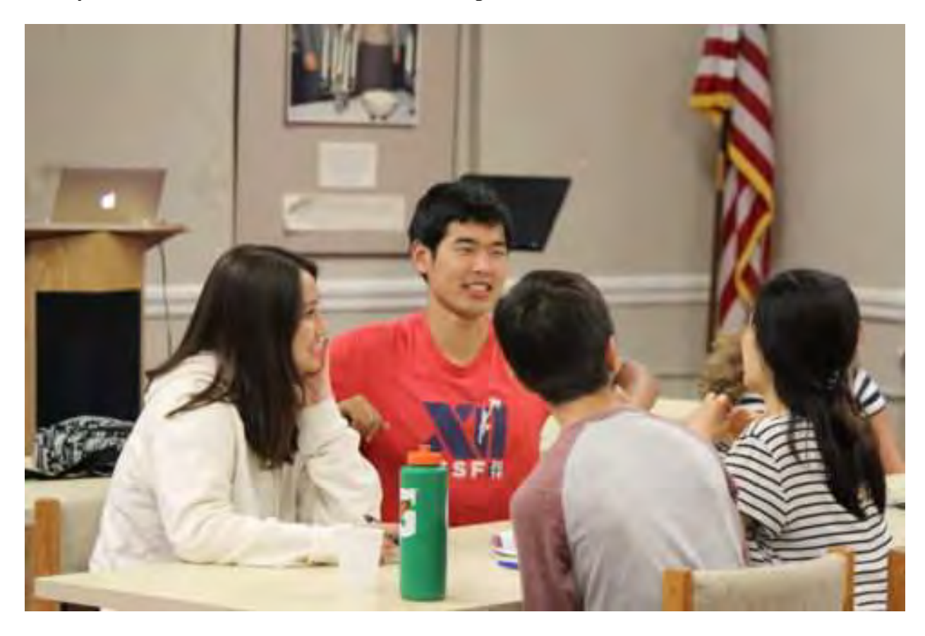
"A great environment to bring up any questions or problems your dealing with without feeling any judgement. Very thorough."