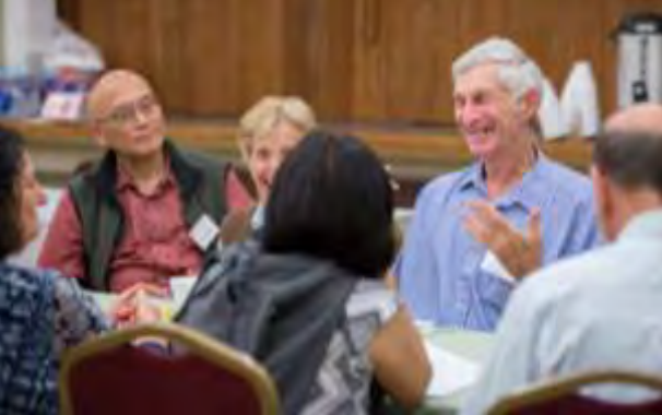
On September 13-14, a National Parents Matching Convocation was held for over 100 parents from 12 different States. Here are some of their thoughts:

"The PMC is an environment where God's spirit moves. I appreciate all the lectures and especially Crescentia and staff for their sincerity for the blessing."