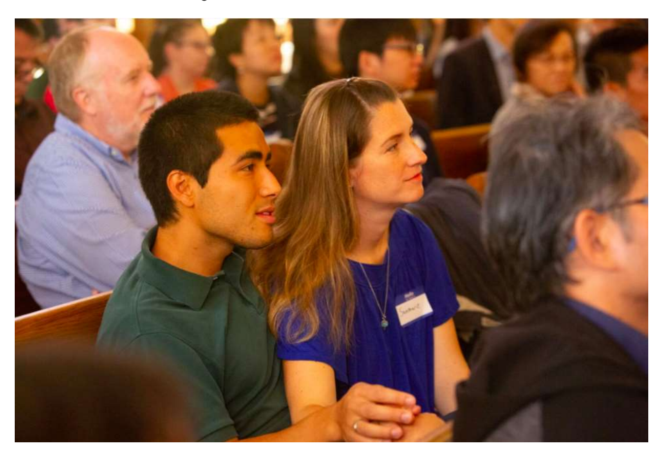
The Clifton, New Jersey Community made this event so amazing with the venue, attention to detail, and support!

to their internal home of God's grace and love.