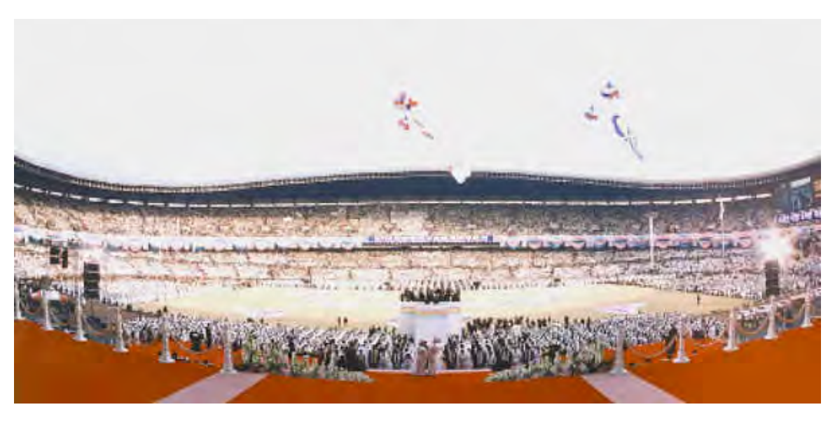
The Blessing of 360 Million Couples on February 7, 1999, Seoul, Korea source and link to an enlargement of the above photo:

http://www.tparents.org/Library/Unification/Photos/Bless-Ph/Bl99-stadium1.jpg