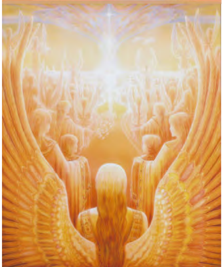
Top image, a cropped section of the image at this source