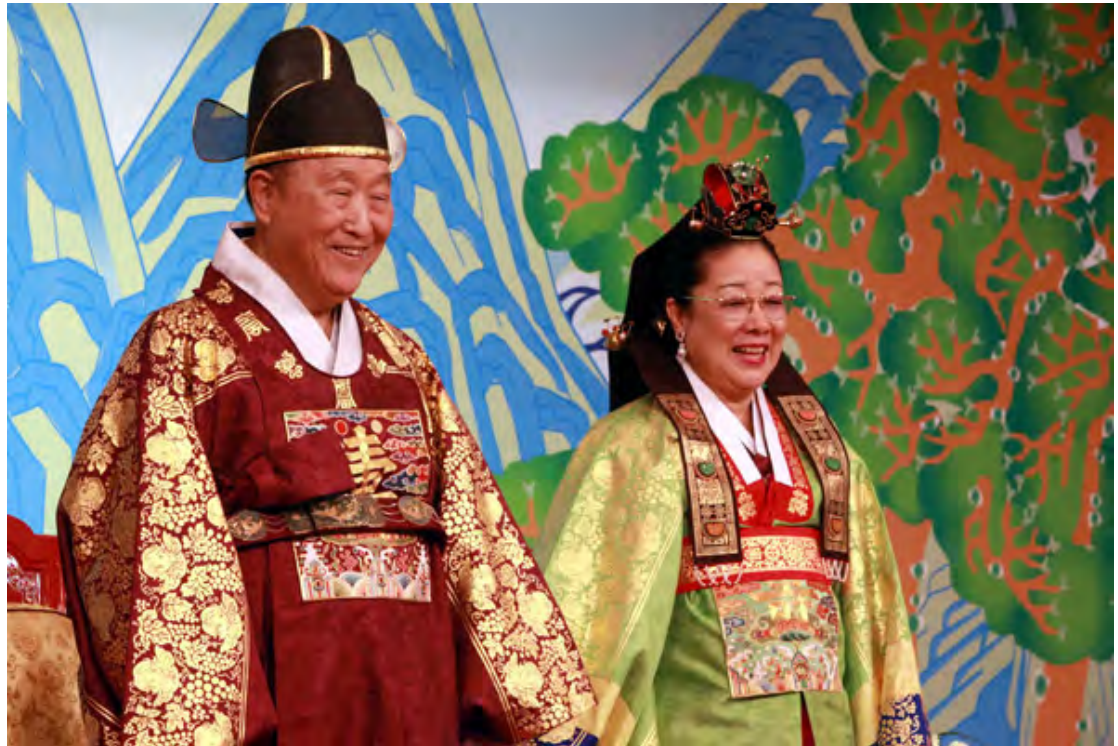
True Parents' Golden Wedding Anniversary, April 29, 2010