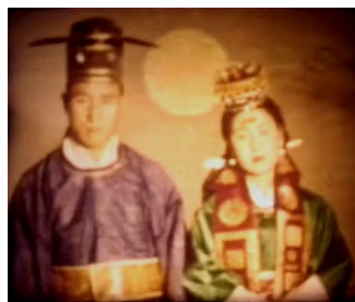
True Parents on their Blessing Day

Here is a video showing film footage of True Parents' Holy Blessing in April 1960 solar and also excerpts from the formal celebration of their Golden Wedding Anniversary in April 2010 solar. Duration 3:59 minutes