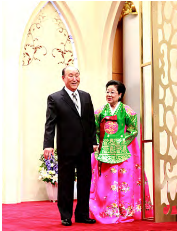
True Parents' Golden Wedding Anniversary the 16 th day of the 3 rd month of the 1 st year of 천기 Cheongi (the Heavenly Foundation) ~ April 29, 2010

Until now we have attended True Parents only in sorrow and pain, but from now on we should attend them in joy and in freedom. When God can dwell within our hearts, only then, when we are joyful, will God be able to say, "Yes, your joy is my joy!" ❖