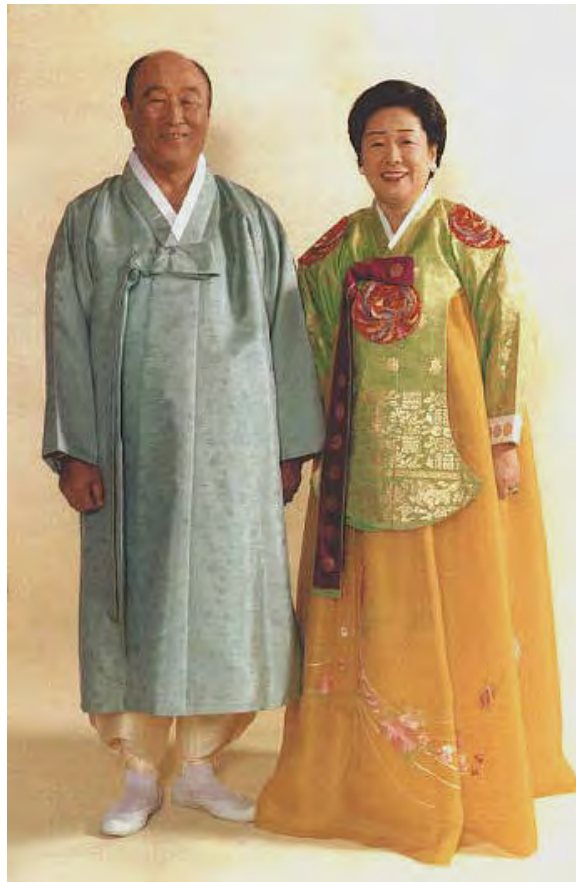
Photo portrait of True Parents October 1, 2007

Why are we trying to restore a people? We are creating a people to attend the victorious True Parents and to