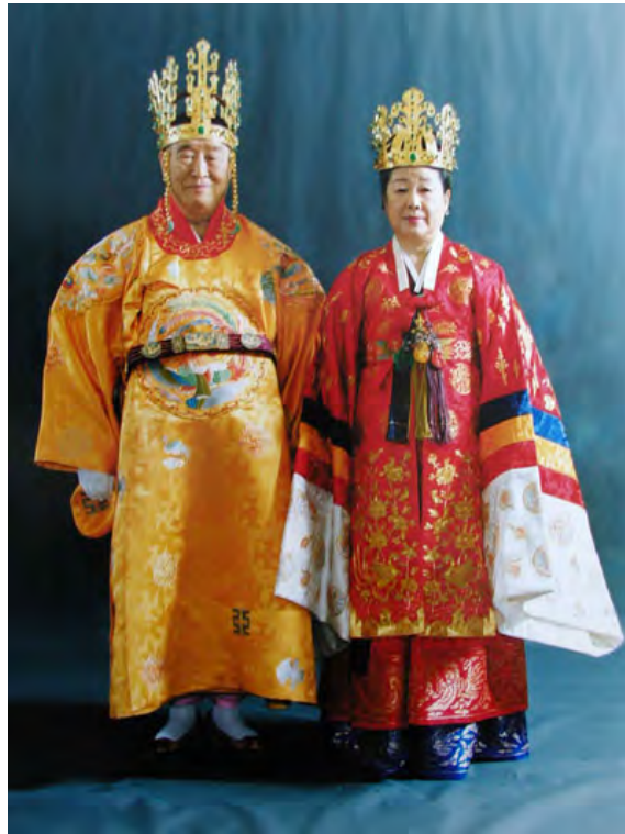
The Coronation of the King of the Blessed Families of the Peace and Unity of the Cosmic True Parent and the True Parents of Heaven and Earth, February 6, 2003

Originally, Adam and Eve would have become True Parents by uniting with each other centered on God; then, Parents' Day would have been established and the entire universe would have sung praises in the name of the Universal Parents. Thus, True Parents' Day should have been a day of joy with the entire universe singing praises together in the name of the