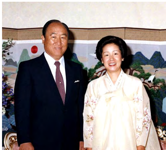
Our beloved True Parents, the Reverend and Mrs. Sun Myung Moon