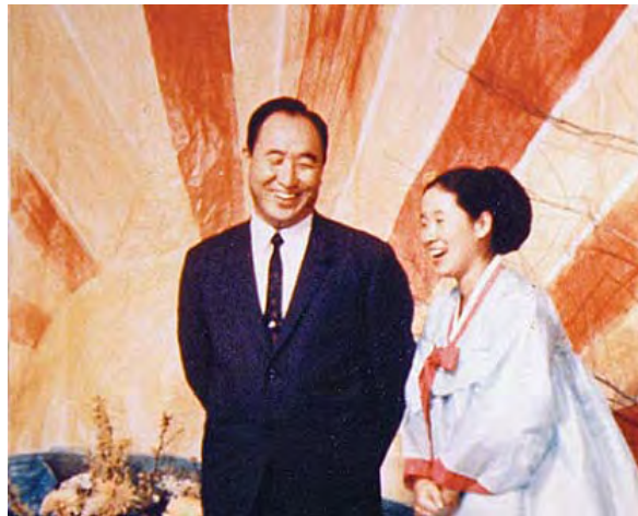
Celebration following the blessing of 13 Western couples among the 43 Couples, Washington DC, February 28, 1969

Tell all the world, spring has come eternally! Hallelujah, Glorious Day of Joy!