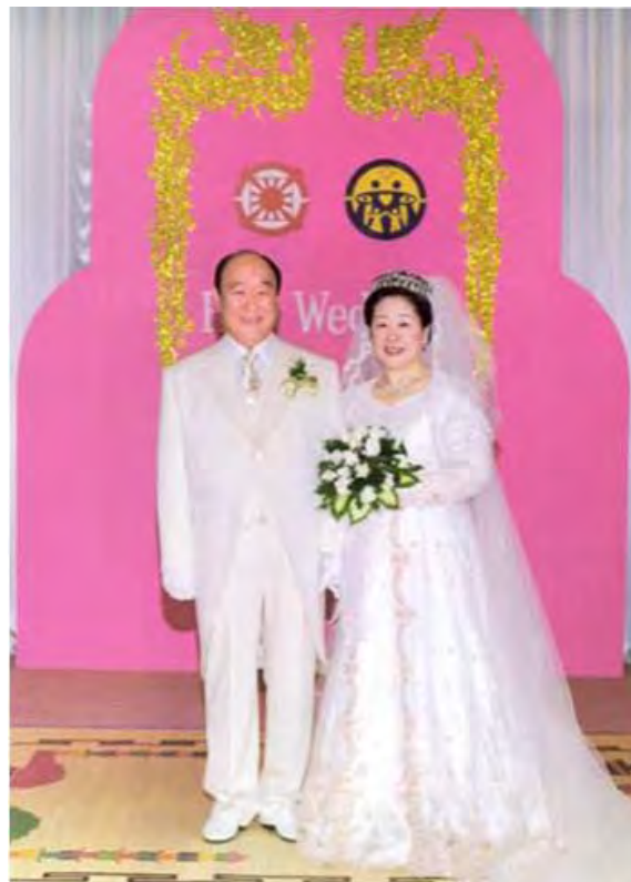
The Holy Marriage Blessing Ceremony of the Parents of Heaven and Earth Opening Cheon Il Guk February 6, 2003