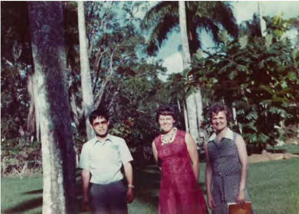
A pledge to Heavenly Father for the victory in Fiji and three shouts of “Monsei!” concluded the ceremony.