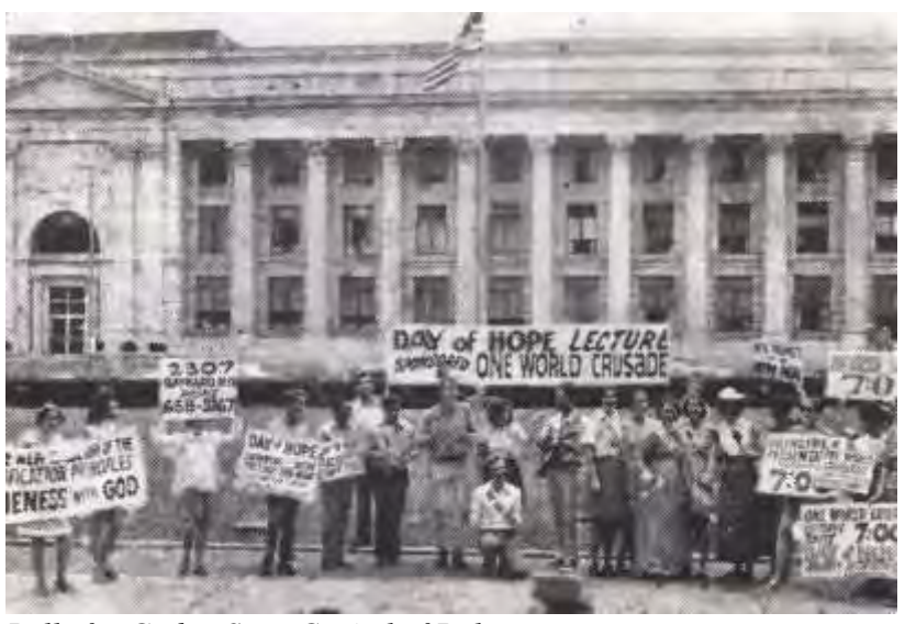
Rally for God at State Capitol of Delaware.

Since we are returning to normal program of seven-day Crusade, weekly family meetings to improve our Unit function and operation have been restored. Also morning prayer meetings will be conducted by small groups, to give all a chance.