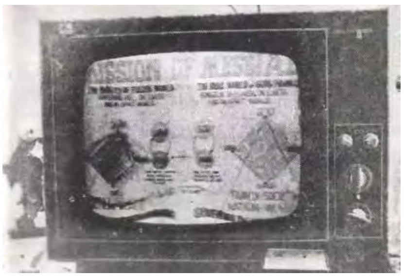
Unification Principle Chart shown on TV