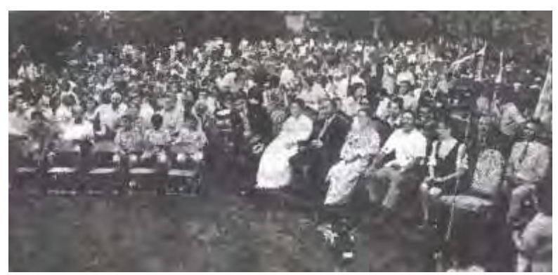
Our Leader and distinguished guests watch entertainment

There were fireworks when the Mobile Unit Commanders and State Representatives came to Tarrytown. Even though plans for a July 4th Celebration were not made until June 28, Trainees, Belvedere and HSA staffs -- everyone in fact, pitched in to make it a big success. The grounds were gaily decorated with multinational flags, streamers, banners and scented candles.