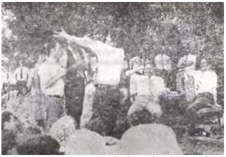
Performing a skit before our Leader during the July 1st Celebration

As many of the 5,000 people left the Estate after the fireworks were over, they thanked us for holding the festivities and said they would like very much to visit Belvedere again. Some plan to come to weekend workshops. All in all, it was a golden opportunity for the Unification Church and the community to get to know and like each other.