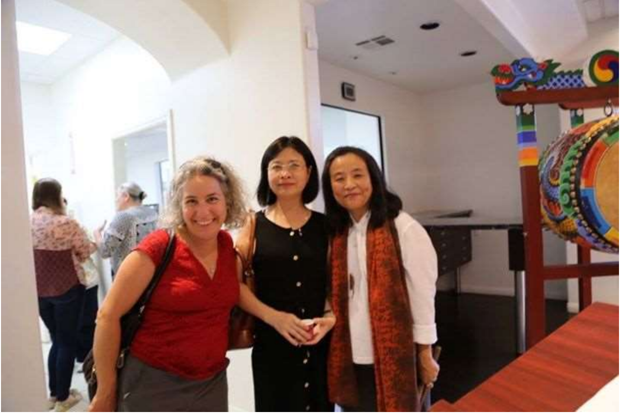
To find out more about Wongu Univiersty and its mission, programs, and services, visit: <u>www.wonguuniversity.com</u>.