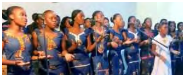
African Choir Competition in DRC

Jan 2014 FFWPU Regional President of Africa