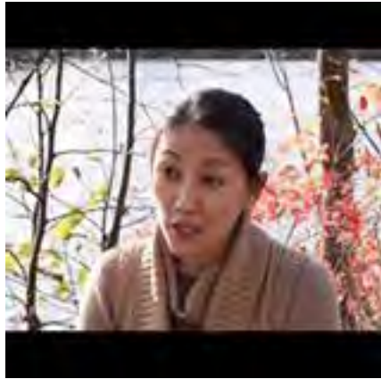
YNH on HJN's efforts to support Mother