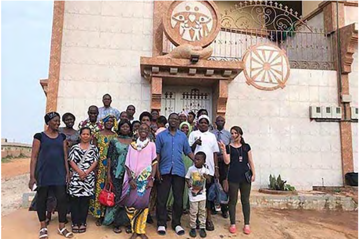
A group of Senegal Unificationists standing in front of the Family Federation center in the outskirts of Dakar, Senegal.