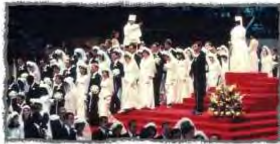
Blessing of 2,075 Couples in Madison Square Garden, NY, in 1982

If and how Singles will follow thru and formalize their newly-formed union, whether by secular and/or religious marriage or any other form of status display, is beyond the scope of this site to take issues with. We just hope to make it easier for Singles to find and court a promising Mr. Right or Ms. Perfect.