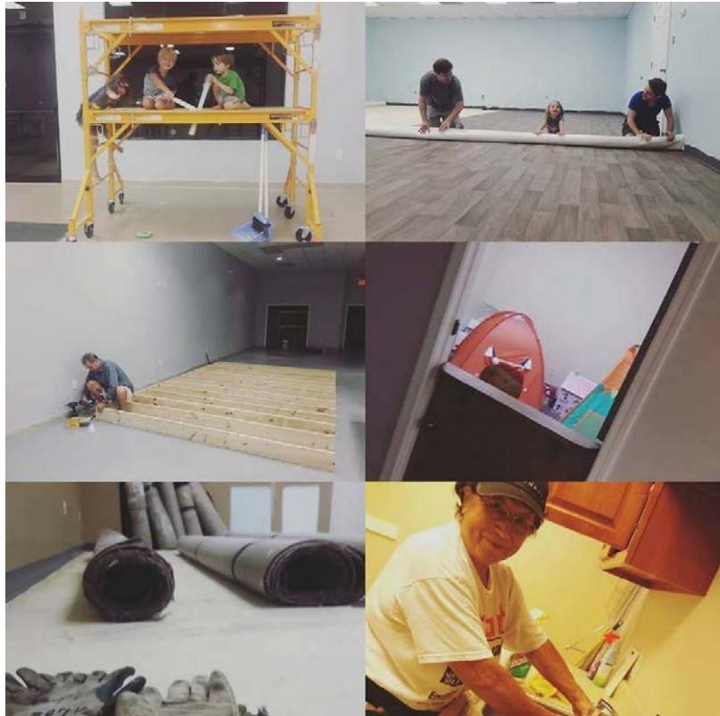
Working together one step at a time