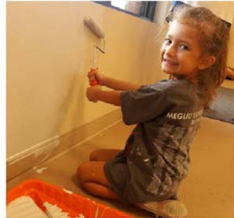
Local members of all ages gathered together to tear out carpets, clean & paint!