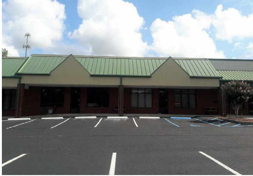
Home sweet home. Two units, one church. 1 for Gather Family Church & 1 for Gather Kids Place.