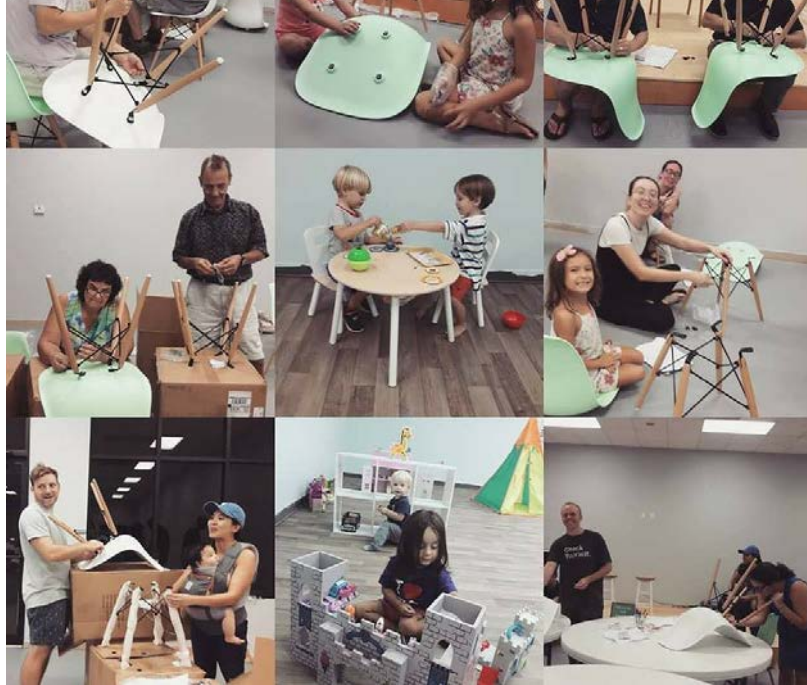
Building chairs together! "For the body is not one member, but many." -1 Corinthians 12:14