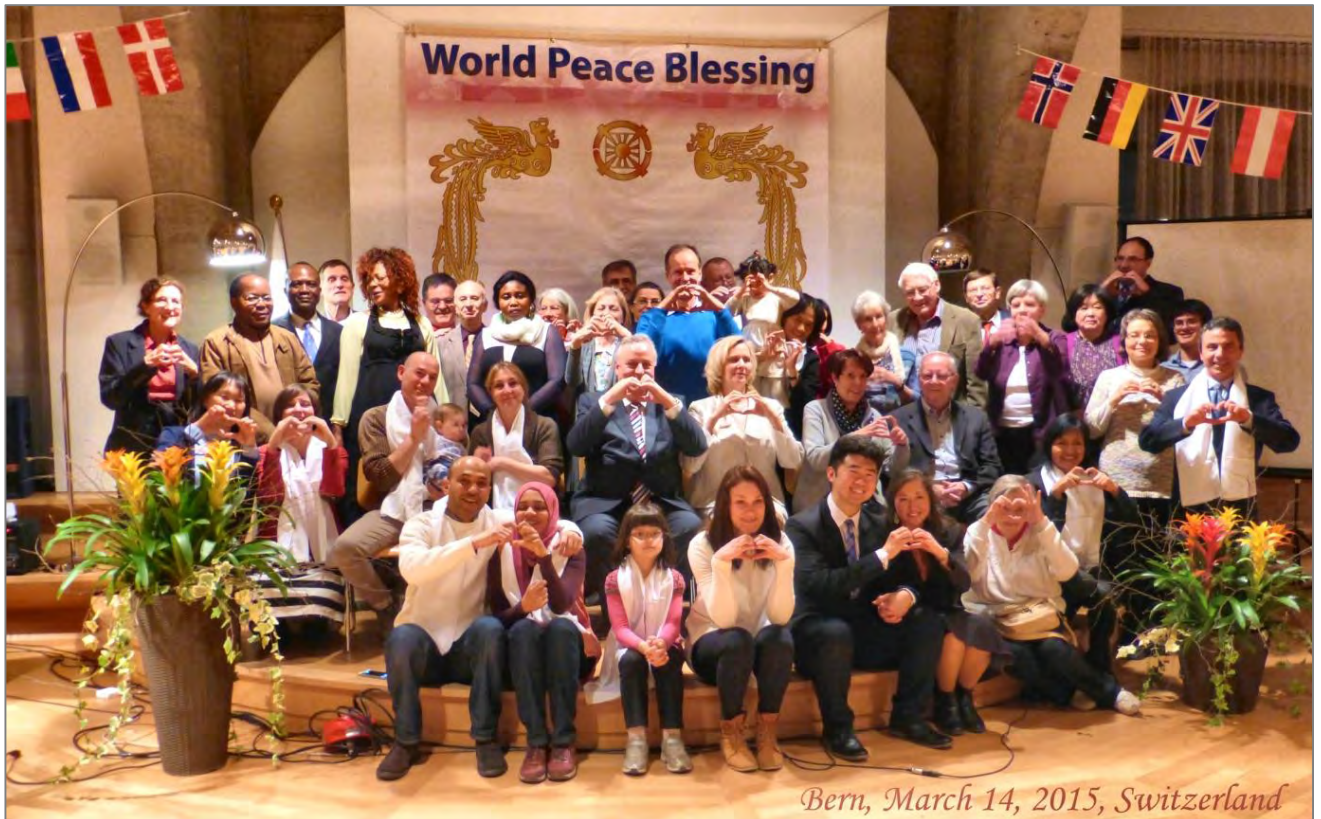
A final commemoration picture of all Blessing participants and supporting staff