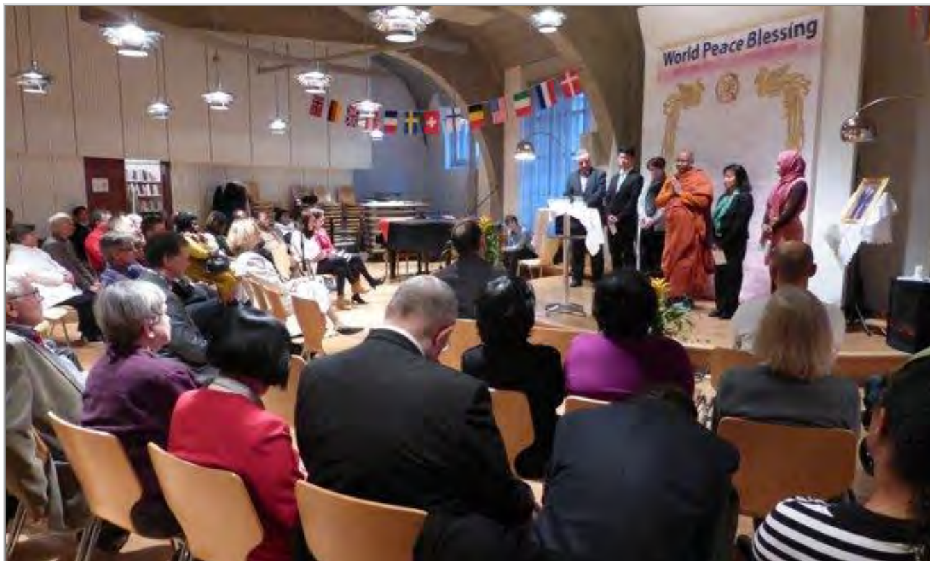
The hall on top of the French Protestant Church in Berne was filled with joy for the World Peace Blessing in Bern 14.3.15 from 2 to 8:30 pm