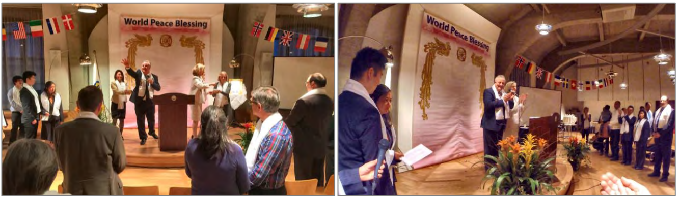
The Officiators sprinkle the Holy Water over all attending couples - Proclamation of Blessing by the Officiators