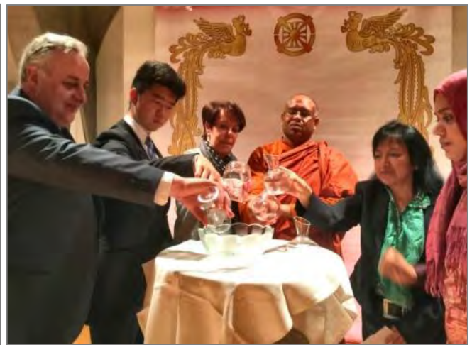
The following water ceremony had representatives of six faiths: Buddhism, Protestantism, Judaism, Islam, Christian Science and Unificationism.

would normally have included his wife (or wives?), his children and his servants. Christianity has always been a religion of communities and the most important unit of these communities was the family. The relationships within the family were changed, deepened and made more tender by the new faith ".