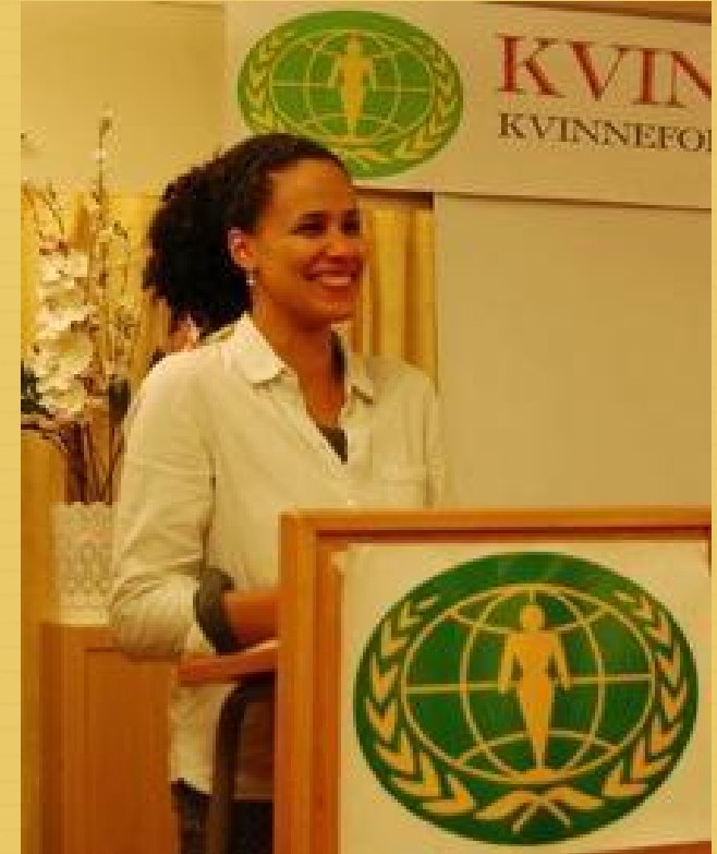
« Motherhood », Int'l Women's Day, WFWP Norway