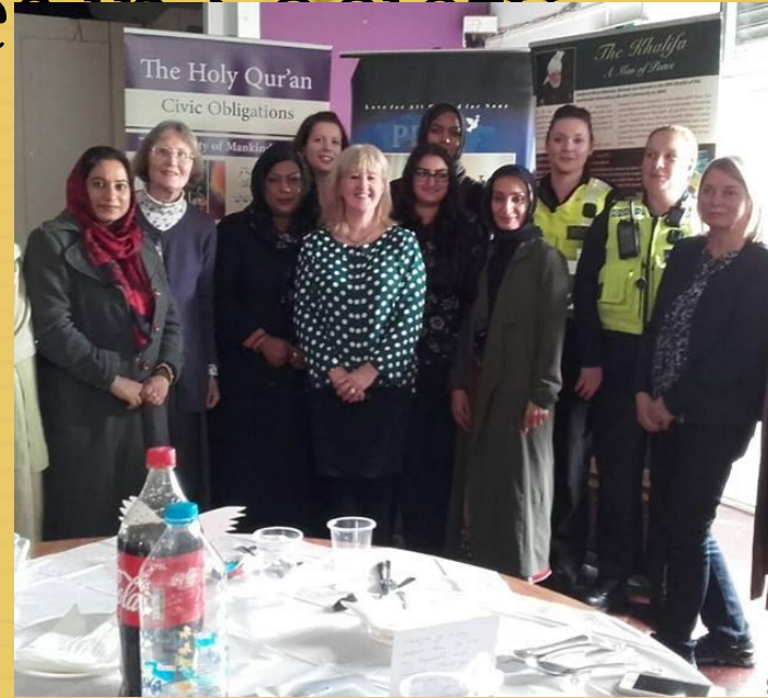
WFP Watford UK leader speaking at Moslem Women's Assoc.