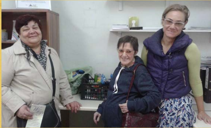
WFWP Malta, Food donations to “Food Bank Malta”