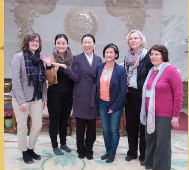
Some European attendees at East Garden