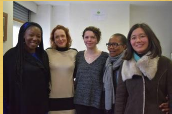
« Women in Society », Int'l Women's Day, WFWP France