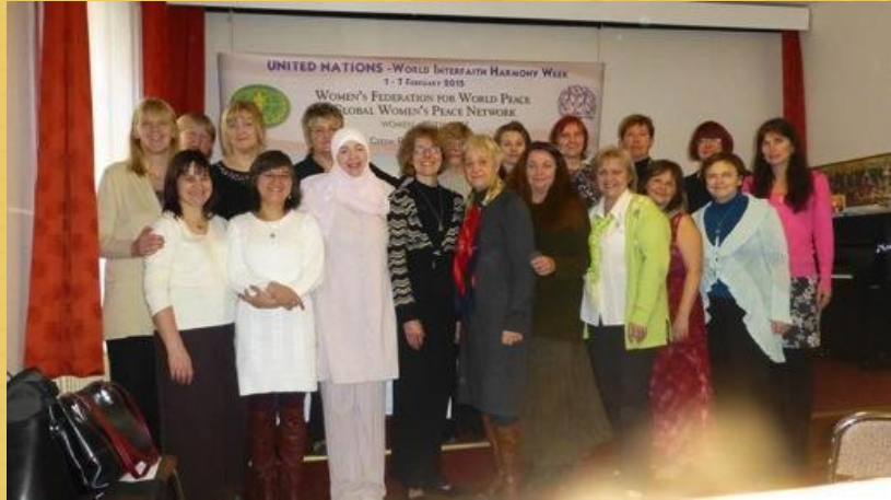
« Women-Faith-Life » Conference, WFWP Czech Republic