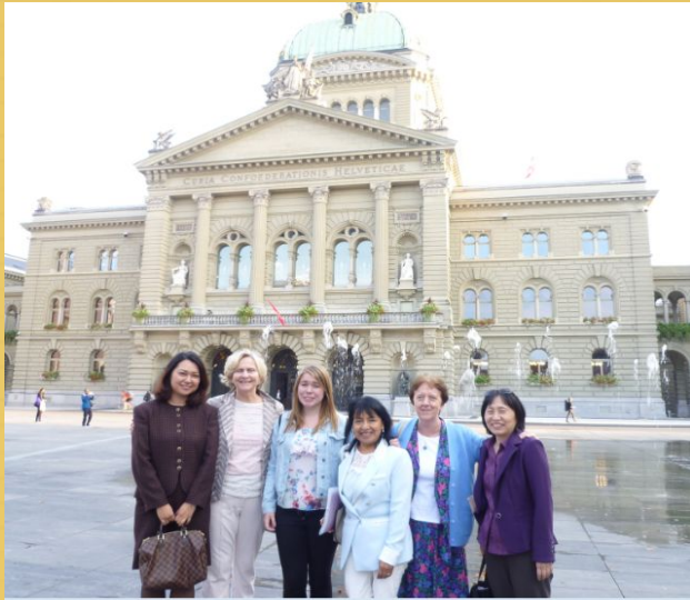
WFWP Switzerland : Meeting women Parliamentarians