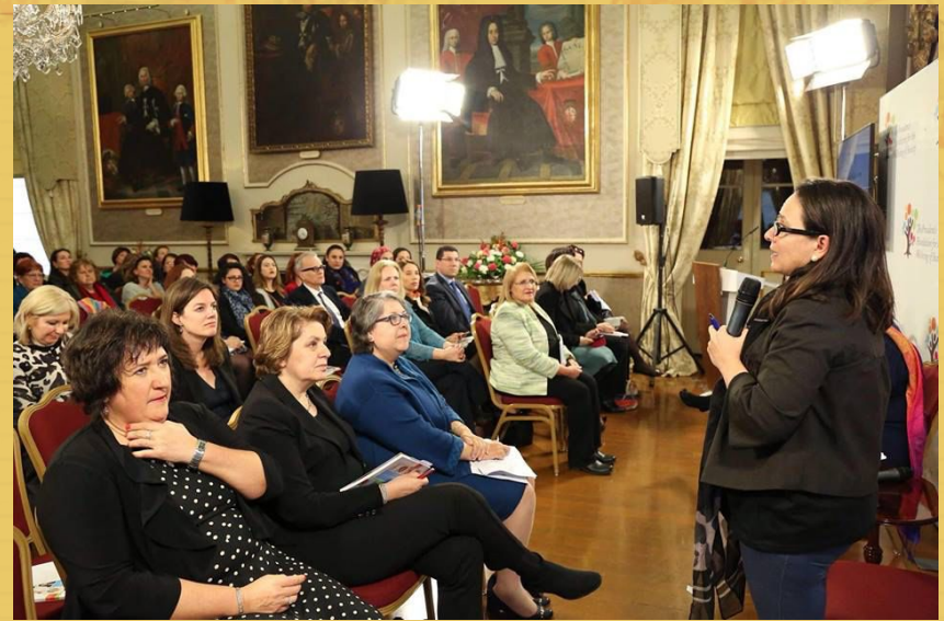
IWD 2017 at Presidential Palace - Malta