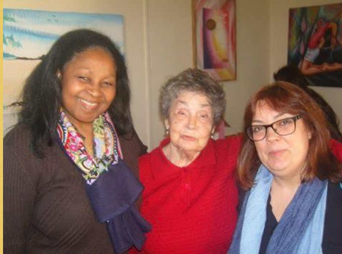
6th International Poetry Festival in Lisbon , WFWP Portugal