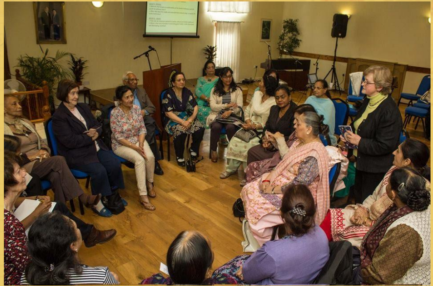
Int'l Day of Families, WFWP S.London/UK