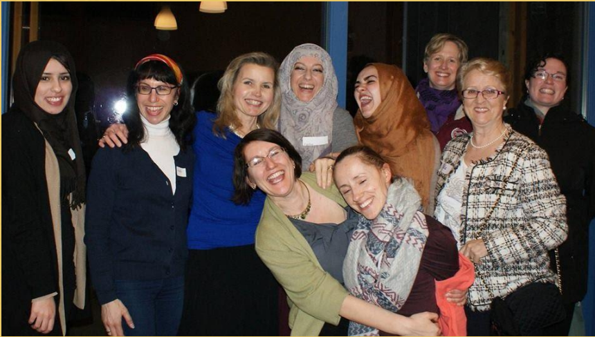
WFWP Ireland, supported a Women's Interfaith Gathering with Sisters of Faith for Peace .