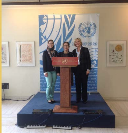
WFWP and UPF intern with former HRC President and during 32 HRC in June