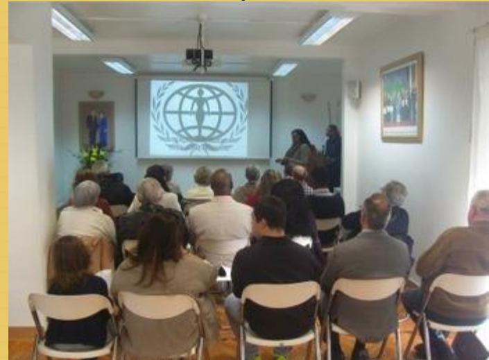
« Conquering True Freedom », WFWP Portugal