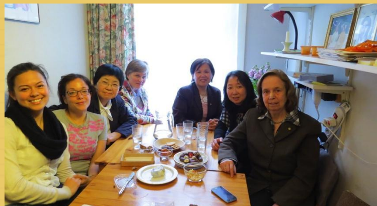
The Women's Peace Academy Netherlands- 24 meetings