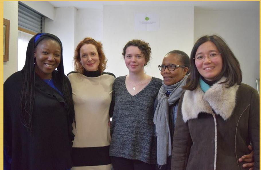
Intl Womens Day: Feminine Qualities and Peace France