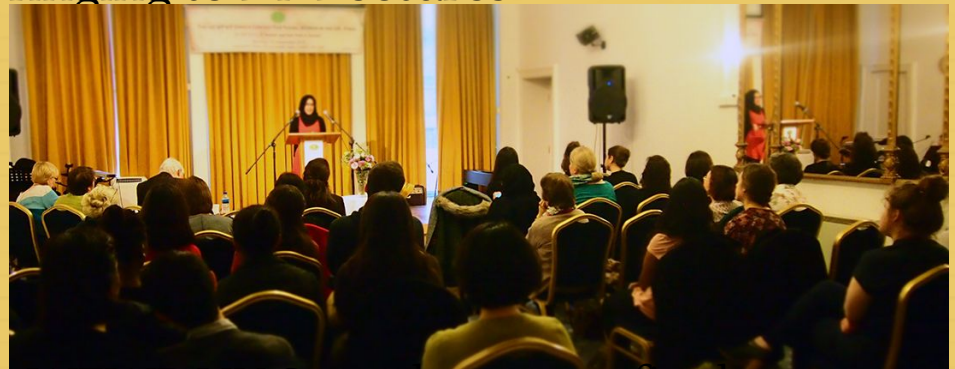
WFWP UK Speech contest finals