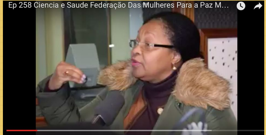
WFWP Port. Radio show guest speaker: Bringing to DP Lectures