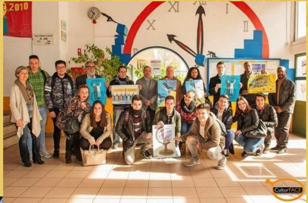
Anti-Racism Event with Students, WFWP Portugal