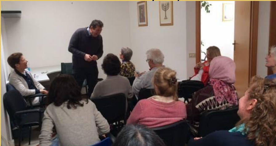
« Emotion and Body Code » in search of new Methodology for health, WFWP Bergamo/Italy