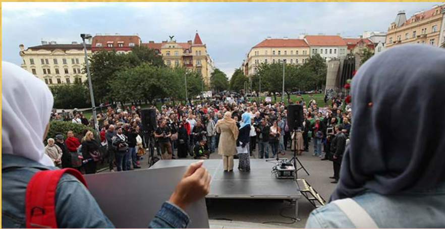
WFWP CZ speaks of TF “Peace Principles” at rally