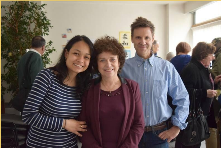
« Masculine and Feminine Qualities: How to Harmonize Them and Why? », WFWP France