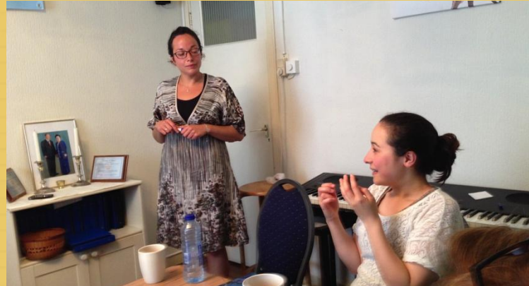
WFWP Germany- Interfaith discussion on gratitude