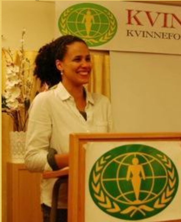
WFWP Norway on Motherhood