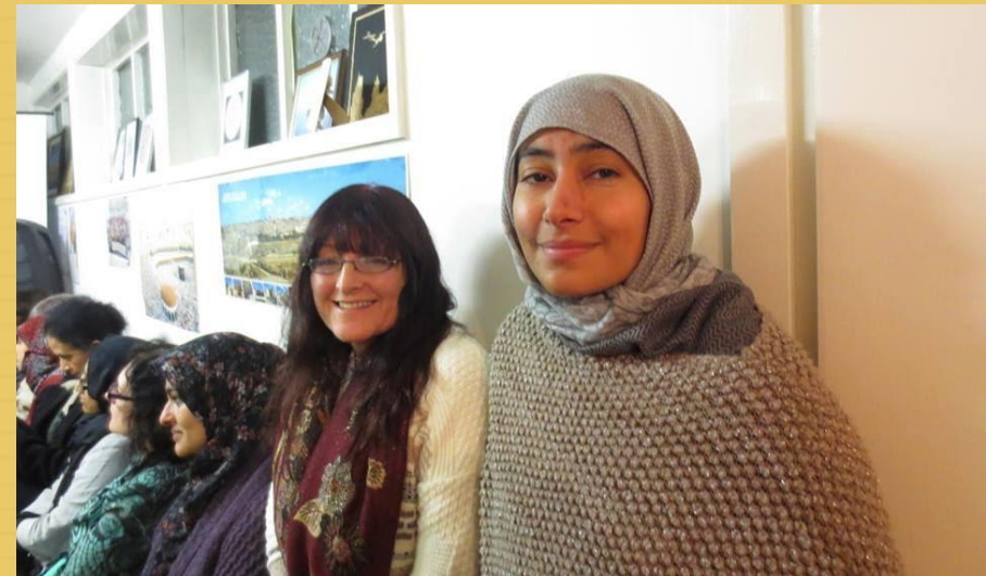
« Love and Friendship can conquer Hatred and Fear » Women's Peace Meeting, WFWP Birmingham/UK