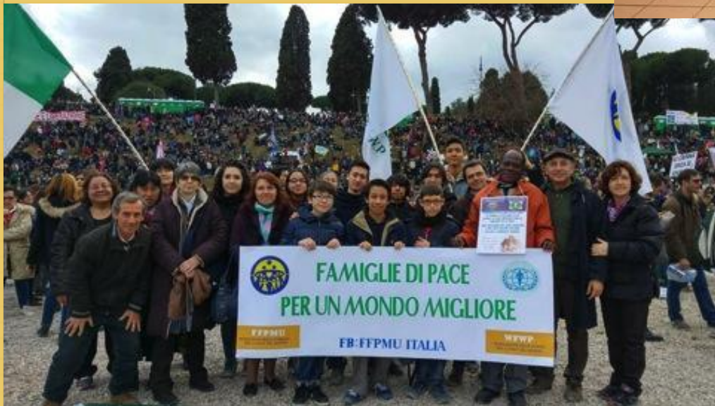
« Defending the Natural Family » Demonstration, WFWP Italy