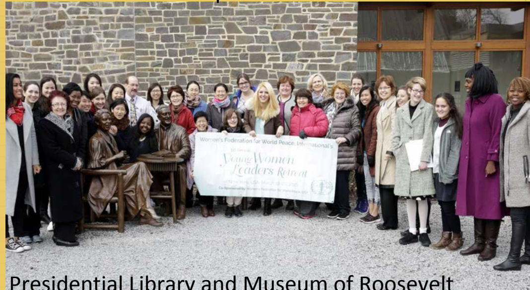
Presidential Library and Museum of Roosevelt