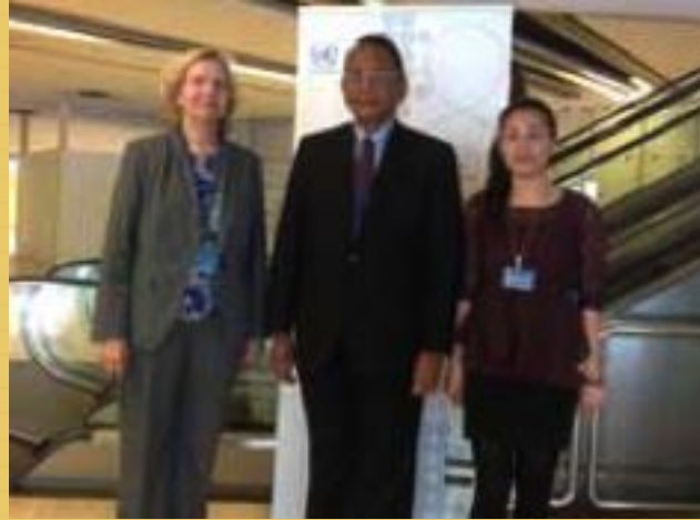
31st Human Rights Council Session February- March 2016 / with Amb Wibisono