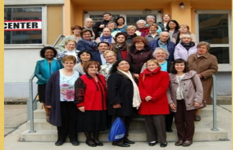
WFWP Germany volunteer for refugees