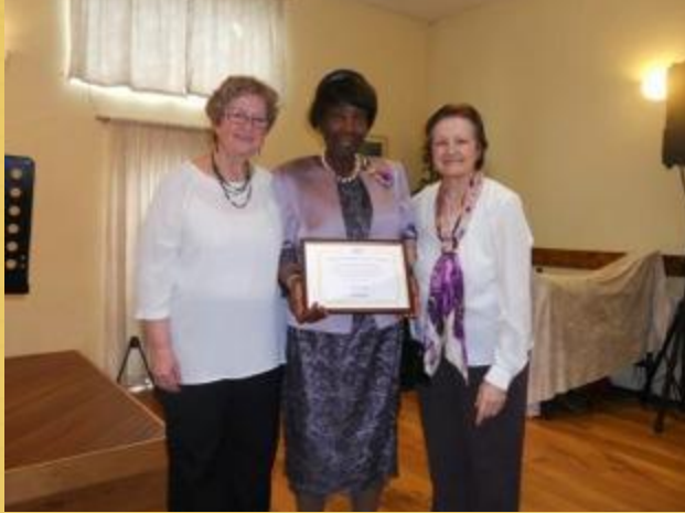
« Balancing Career and Family Life », Int'l Women's Day, WFWP S.London/UK