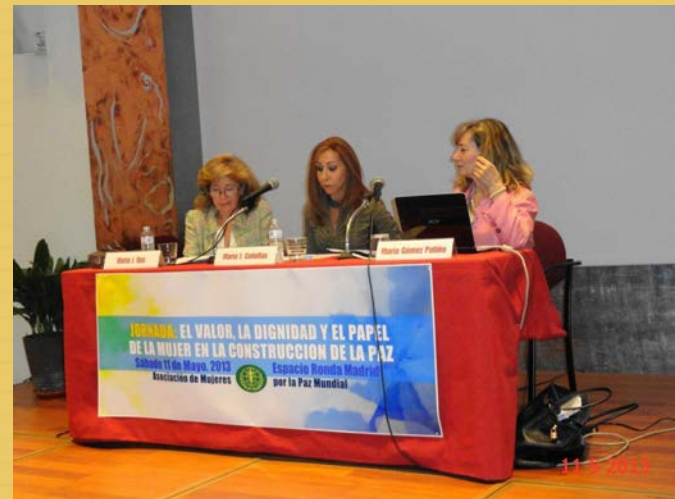
WFWP-Spain at Espace Rondo