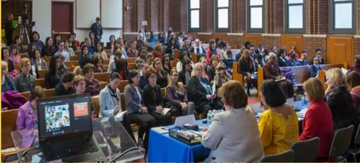
WFWP Parallel event at UN CSW NY