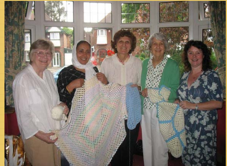
WFWP Birmingham/UK, Women's Tapestry Group- for disaster relief for more than 10