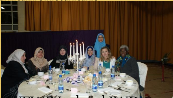
WFWP Ireland IWD