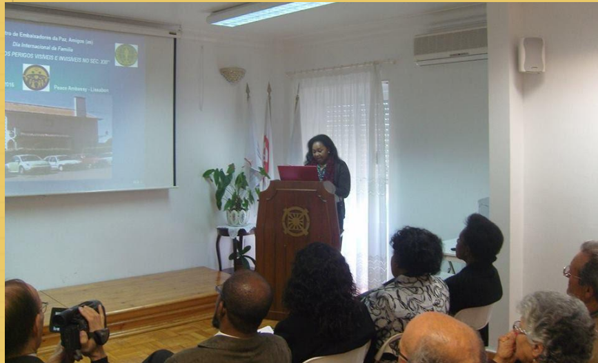
Int'l Day of Families, WFWP Portugal