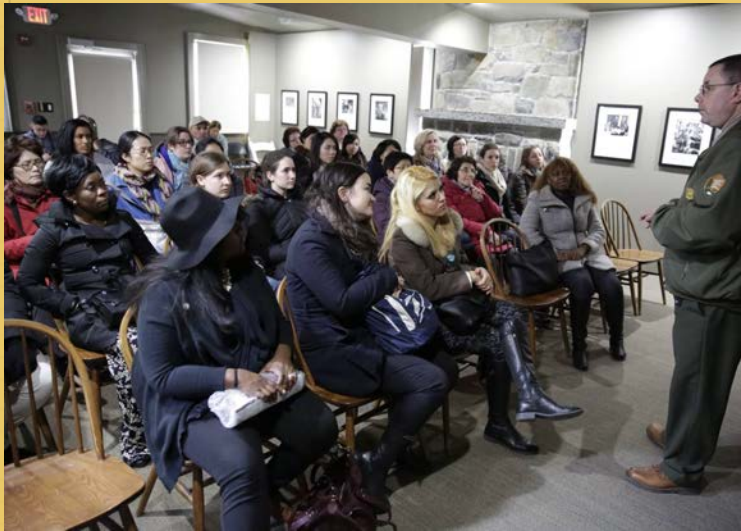
Eleanor Roosevelt's cottage