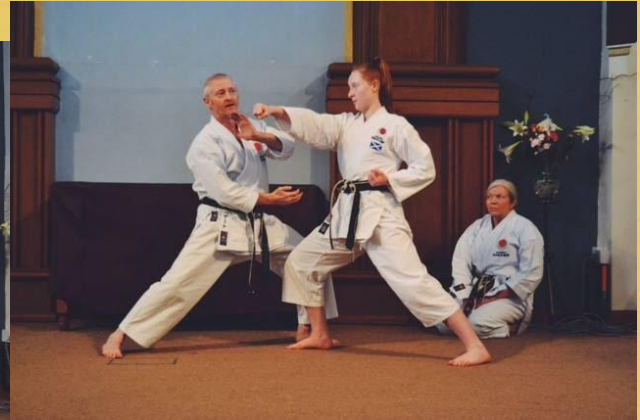
WFWP Scotland, "Experience Japan" at the Augustine United Church in Edinburgh.