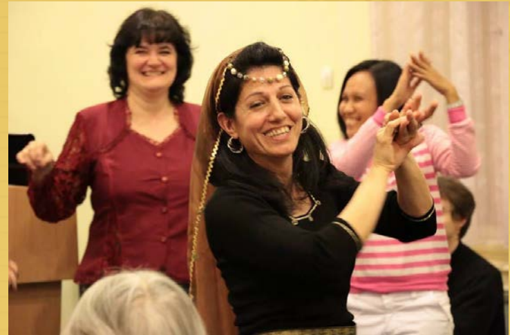
Iranian New Year celebration at Persian Cultural Afternoon, WFWP Hungary