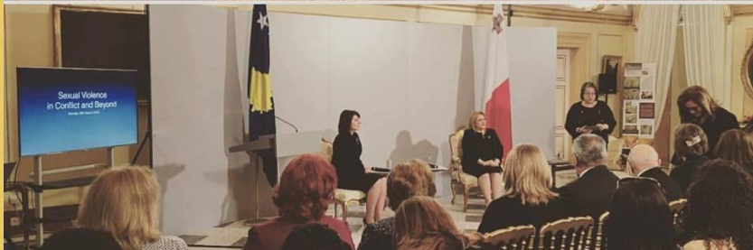
President of Kosovo spoke at Forum on Sexual Violence, WFWP Malta was invited to attend.