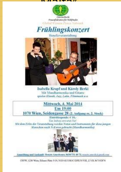
WFWP Austria, charity concert for purchasing musical instruments for North-Koreans.