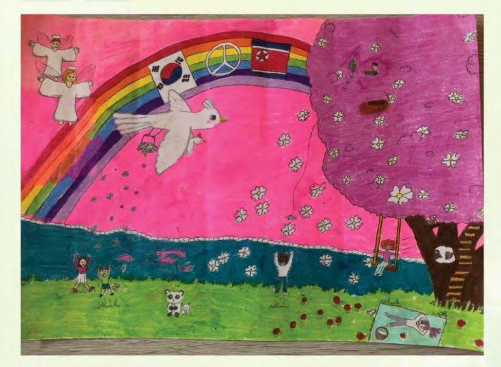
Peace IsabellaHoldhus (Norway) Age: 12