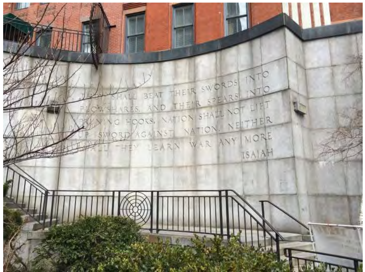
The Isaiah Wall in Ralph Bunche Park across from the United Nations in New York contains this inscription from Isaiah 2:4: "They shall beat their swords into plowshares, and their spears into pruning hooks; nation shall not lift up sword against nation, neither shall they learn war any more."

We often chant "study war no more" (see Isaiah Wall photo below), but study what, then? Indeed, we accumulate valuable knowledge to gradually change from a very violent to a less violent world, and ultimately to a world with zero violence. But what stands above the zero? Unificationism states that Cain and Abel should reconcile and settle their disputes, then live together. In practice, most Unificationists still seek a roadmap for a feasible universal concord. The Unificationist community, not unlike most religious organizations, believes in some form of utopian universal concord. A proper understanding of human security may be an eye-opener to arrive at something more concrete.